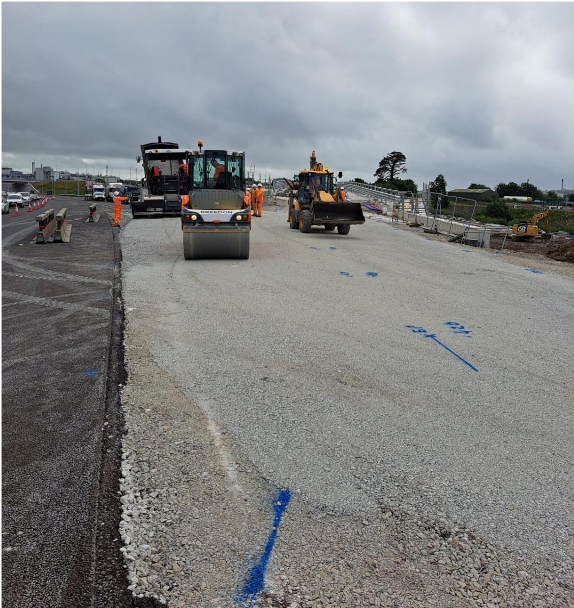
Pavement works ongoing for the Link M tie in at the N25 Westbound Diverge to the Interchange Roundabout.