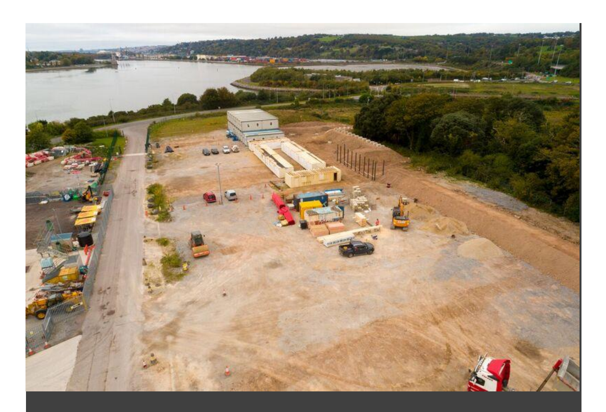
Dunkettle Interchange site office construction underway