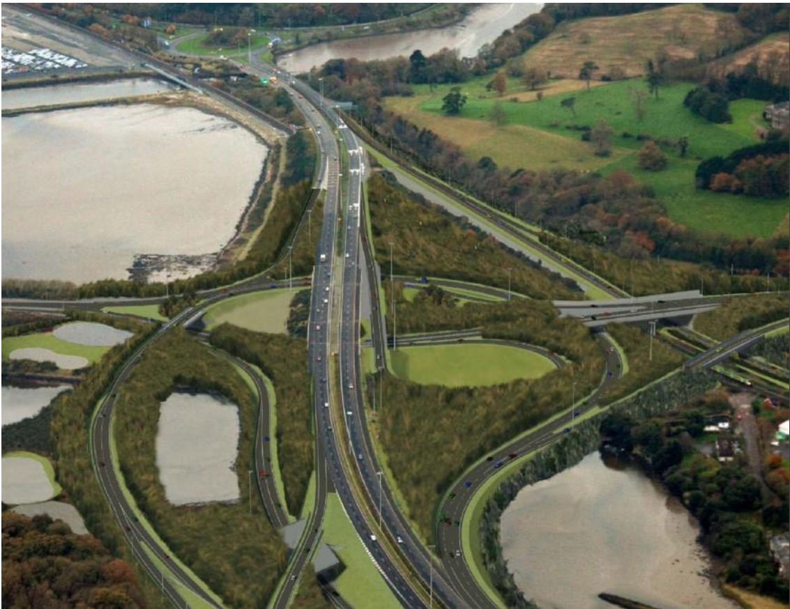
Photomontage of the new interchange, looking westward

Upgrade Dunkettle to a largely free-flow interchange to alleviate traffic congestion.