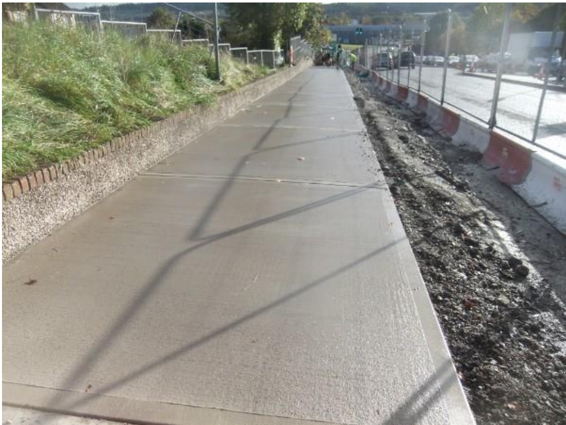
New footpath under construction