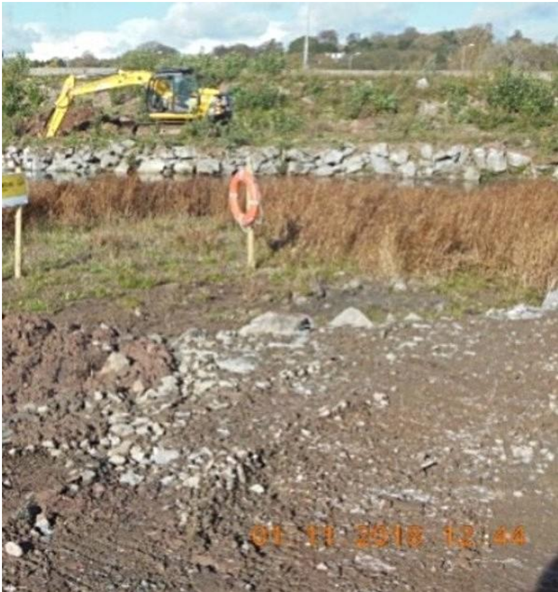
Trial pit works near the intertidal area