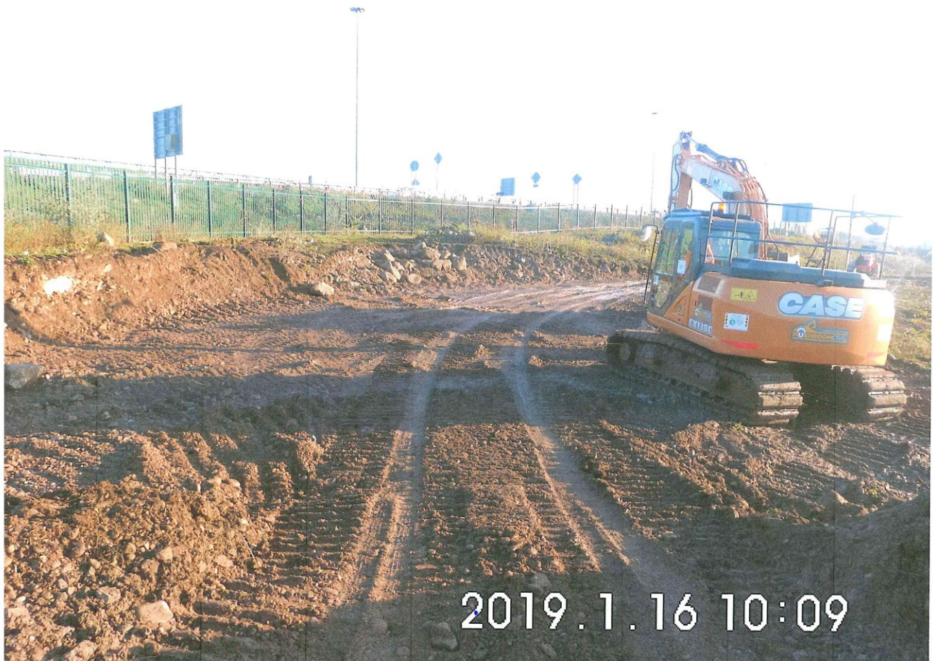
Construction of works access track