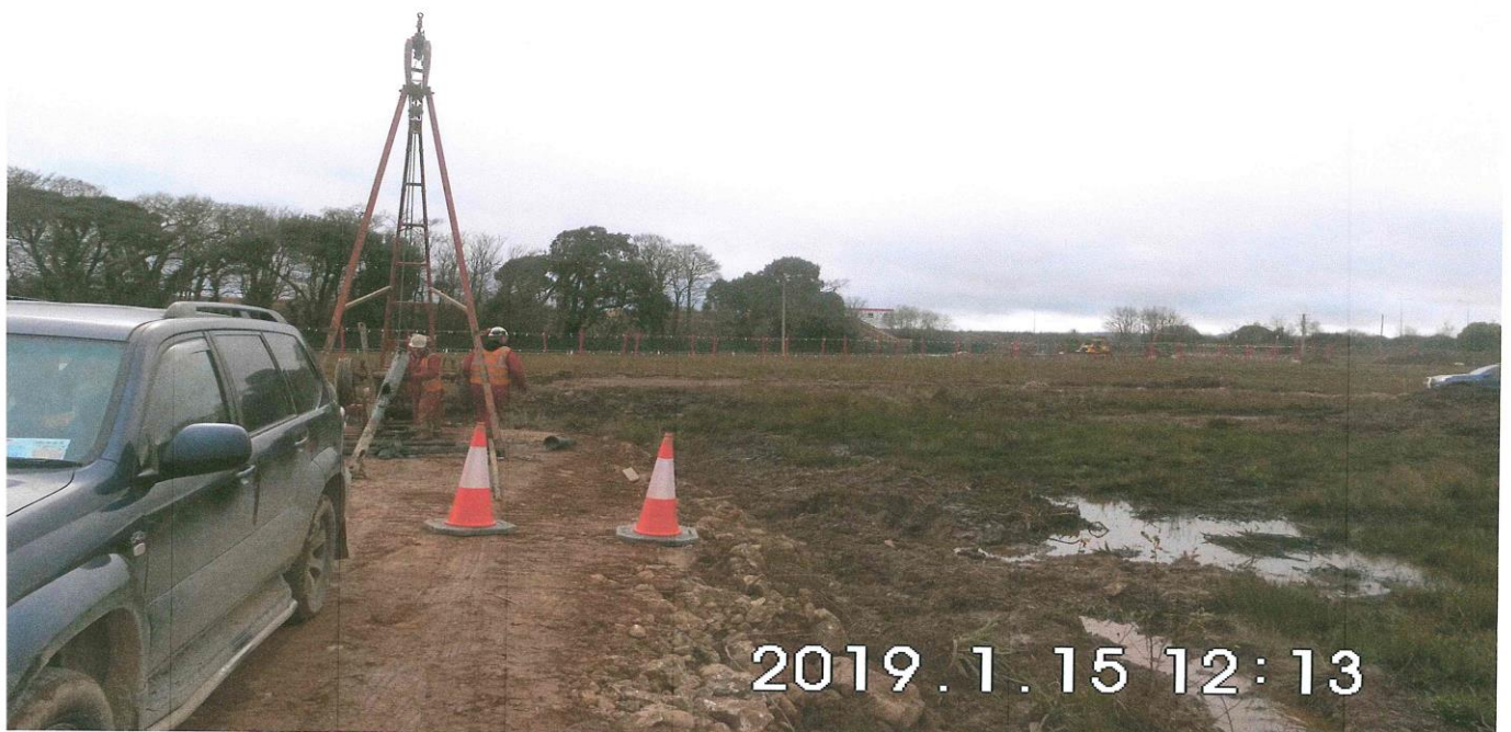
Ground investigation works ongoing south of the N25