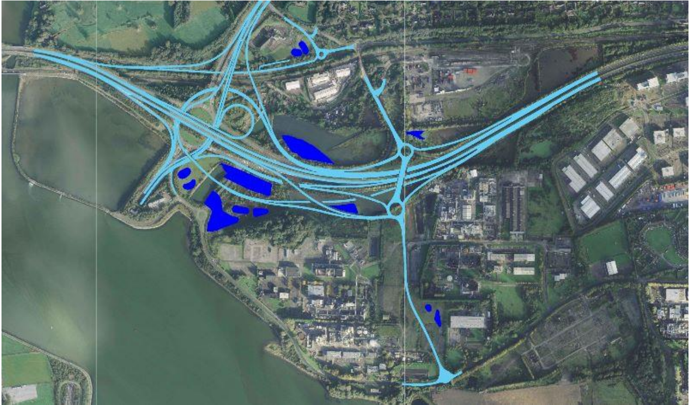
Layout of upgraded Dunkettle Interchange

Upgrade Dunkettle to a largely free-flow interchange to alleviate traffic congestion. More information at www.dunkettle.ie