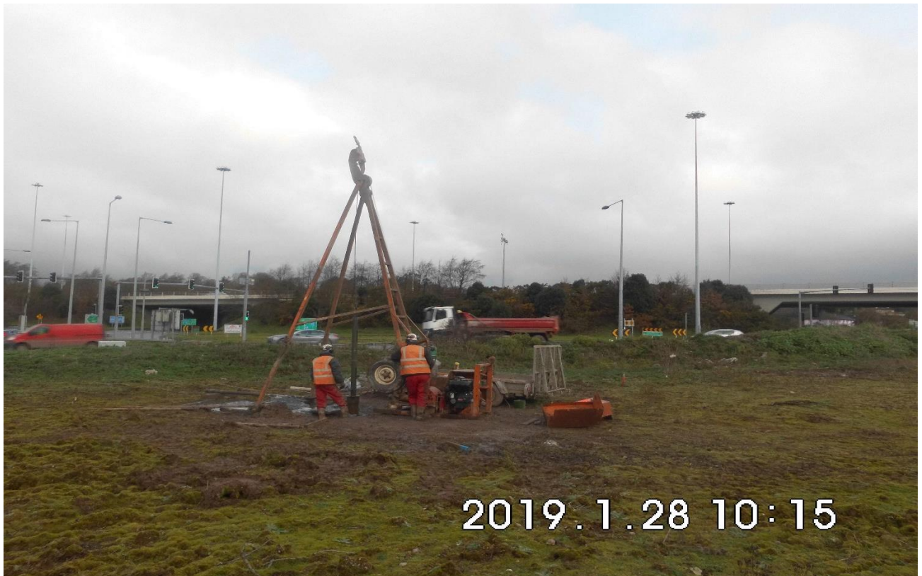
Ground investigation rig south of the Dunkettle Roundabout