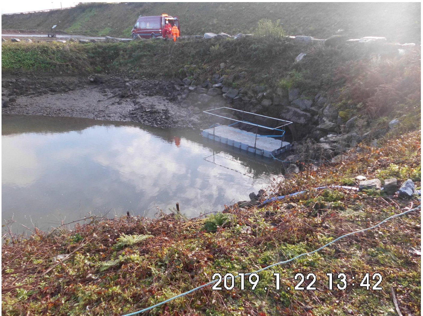
Pontoon in place for culvert inspection