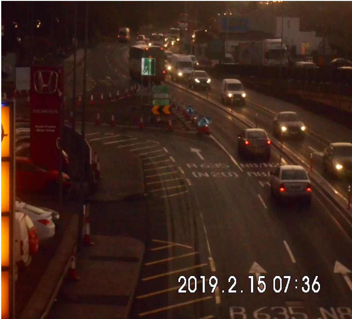
N8 traffic island under construction