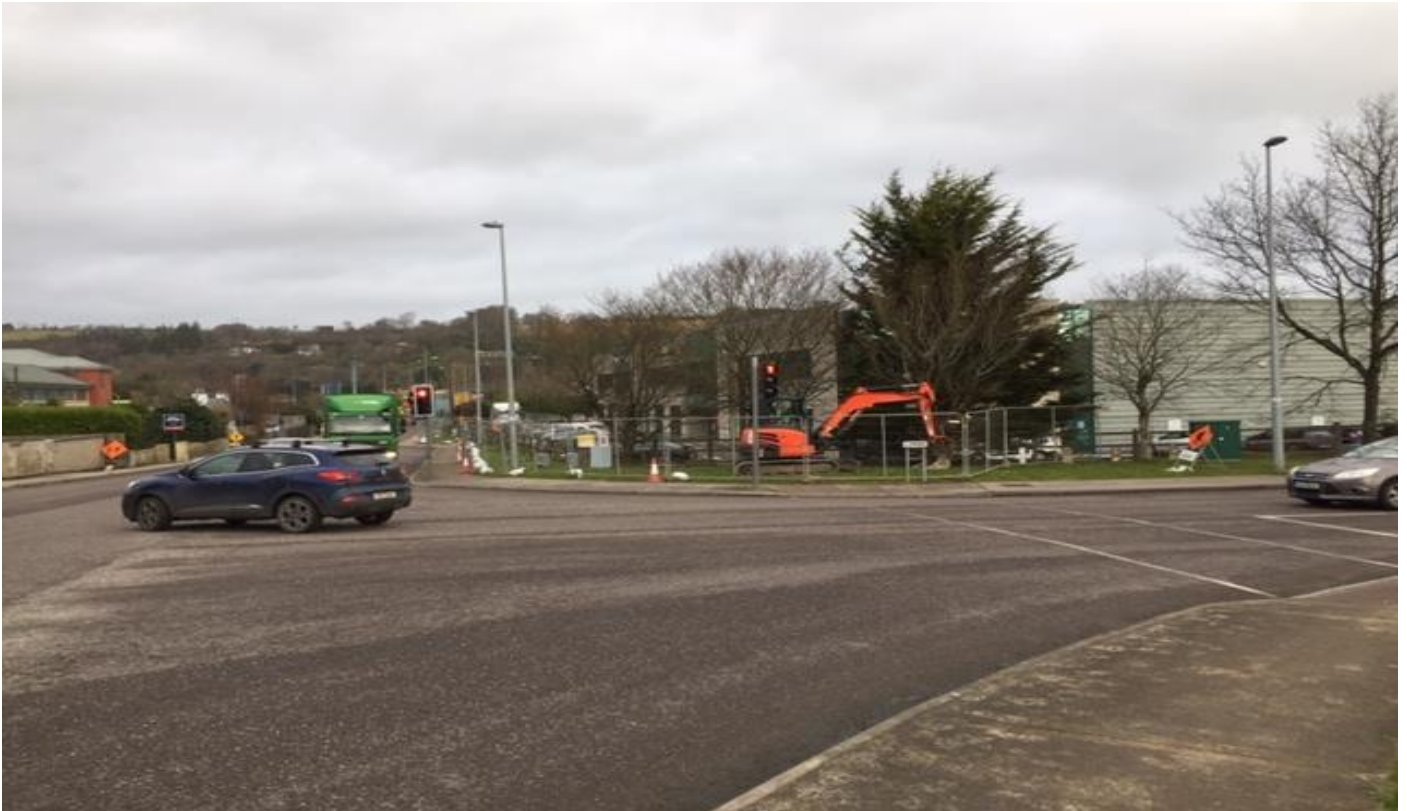
Works underway near Ballytrasna Junction