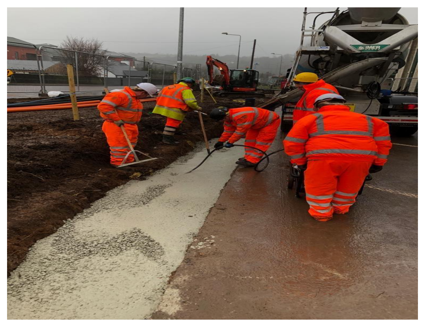
Concrete foundation being poured for new boundary wall at Jones Engineering building