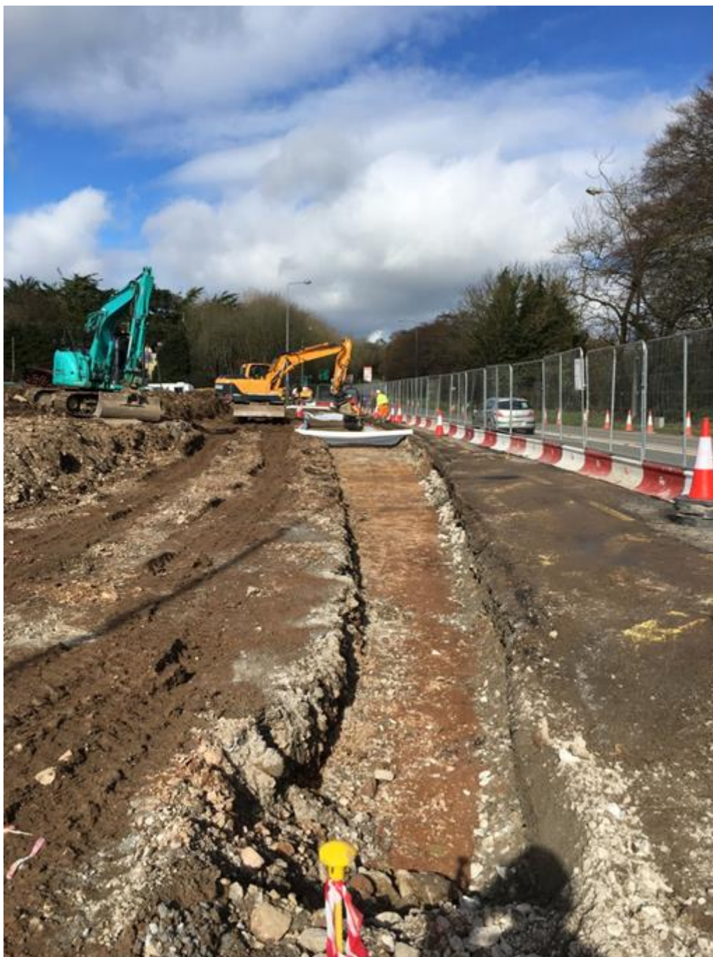
Road widening works at Shannonpark