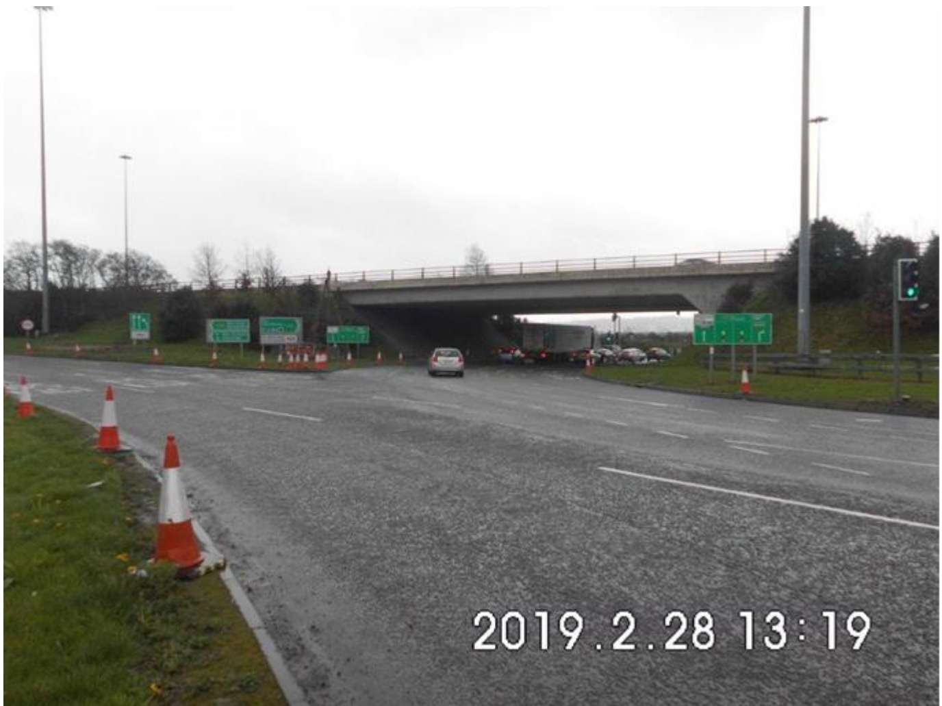
Ground investigation works