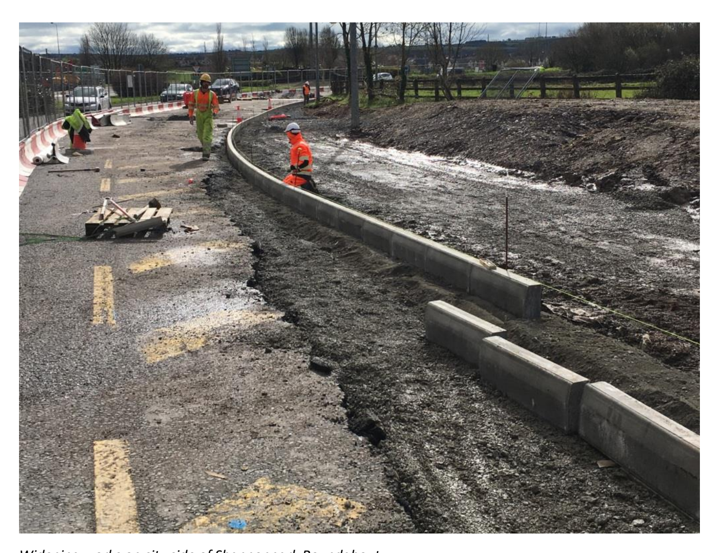
Widening works on city side of Shannonpark Roundabout