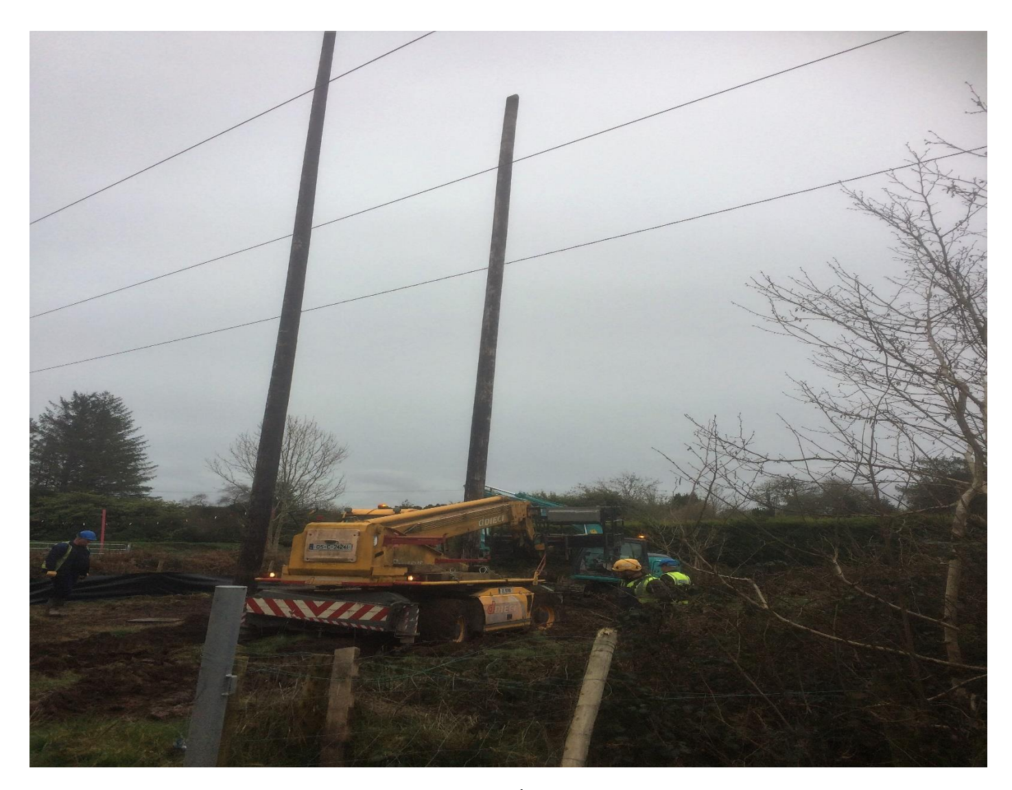
ESB crews erecting new pole set North of Ballyvourney/Macroom