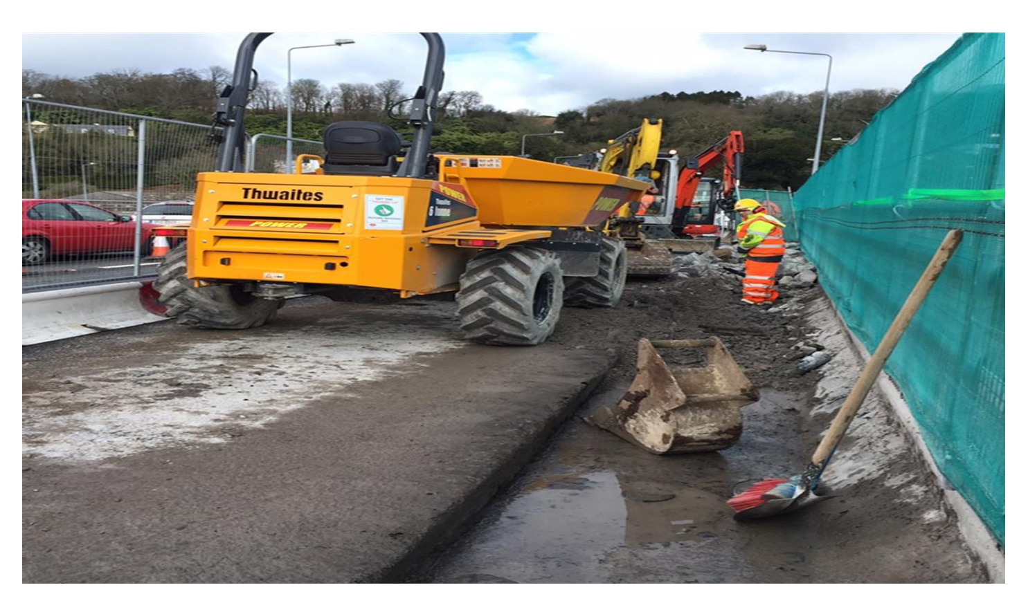
Bridge deck exposed at eastern section