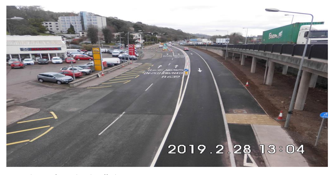
General view of completed traffic lanes