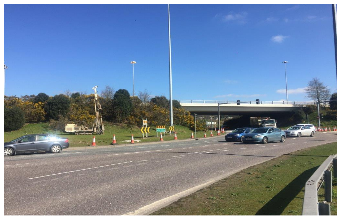
Ground investigation works at Dunkettle Roundabout