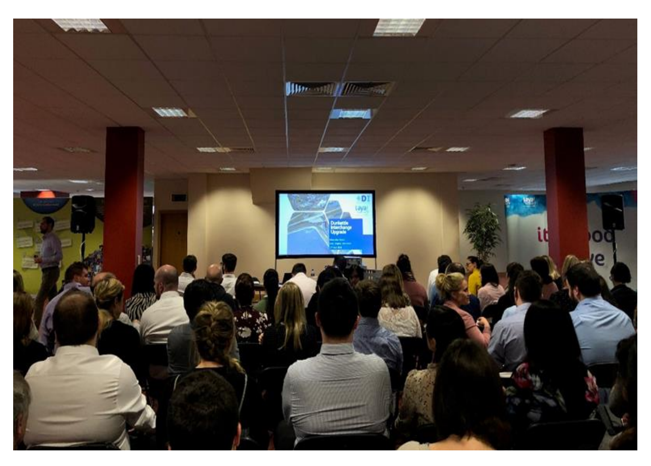
Presentation to Laya Healthcare employees