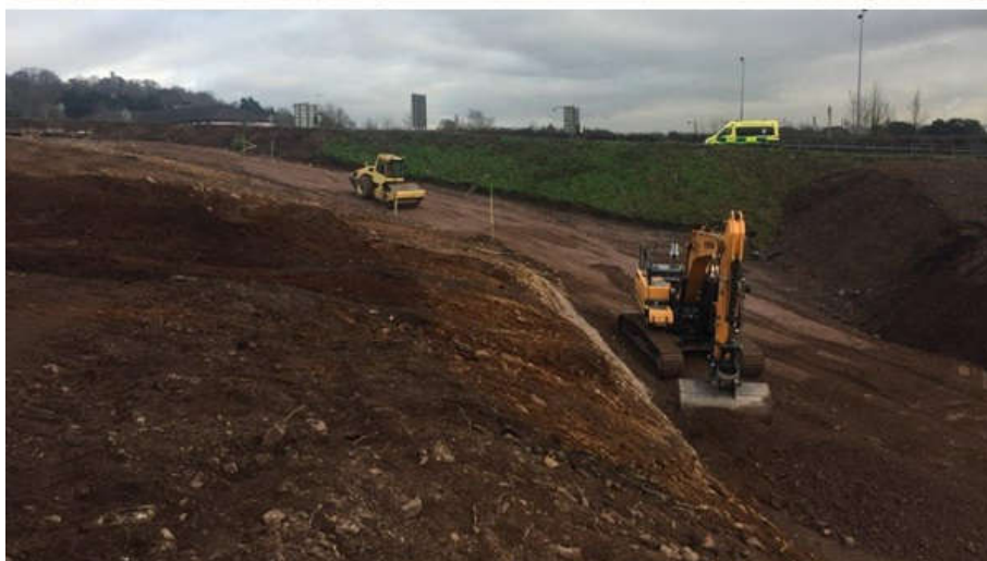
Dunkettle Interchange Upgrade: Embankment construction for the N8 to M8 slip road