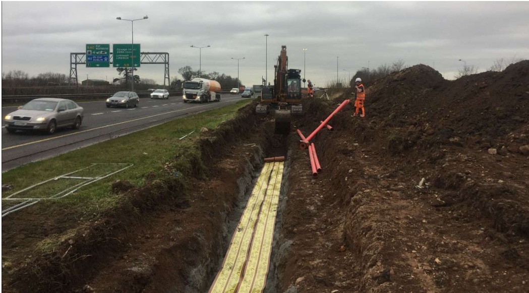
Dunkettle Interchange Upgrade: Installation of service ducting on the N25 eastbound