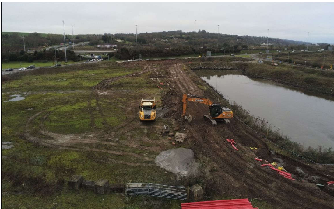
Dunkettle Interchange Upgrade: Installation of service ducting southeast of Dunkettle Interchange, the Interchange Roundabout is visible in the background.

Upgrade Dunkettle to a largely free-flow interchange to alleviate traffic congestion.