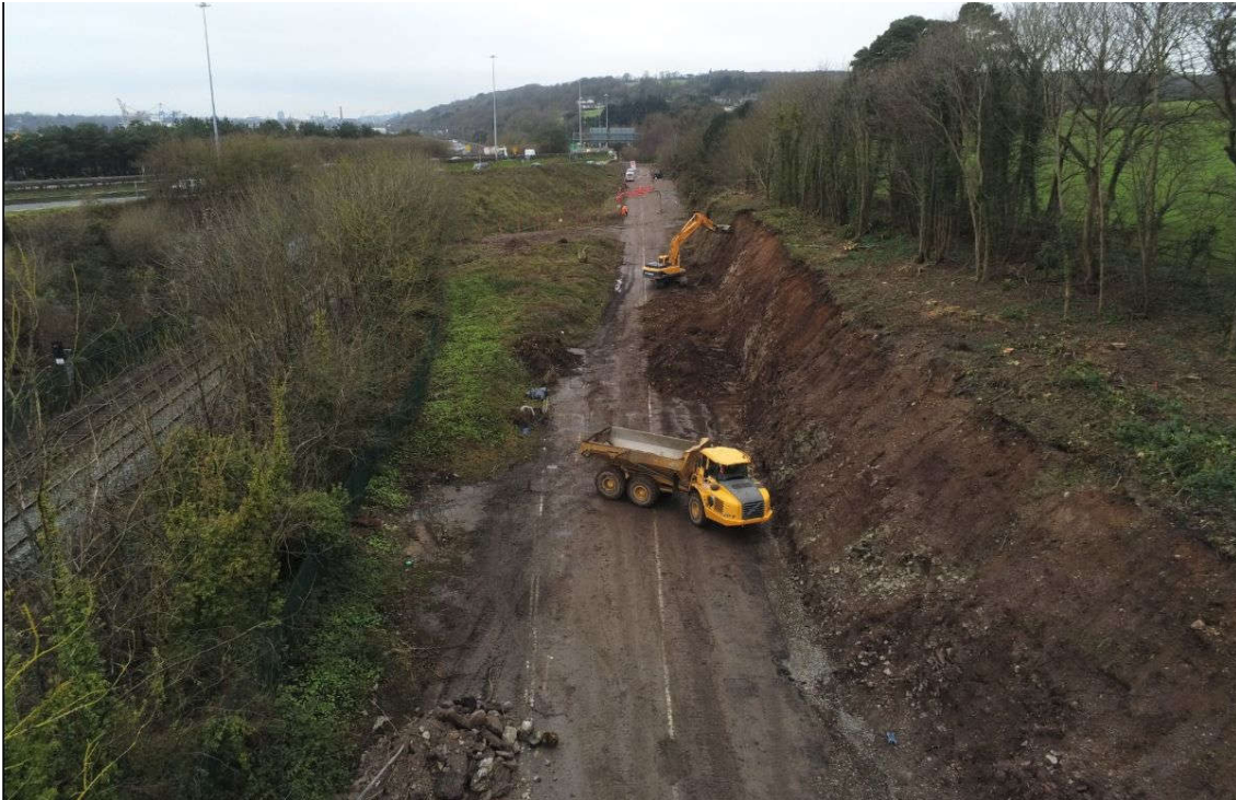
Dunkettle Interchange Upgrade: Excavation works for the N8 to M8 link and adjacent pedestrian-cycleway