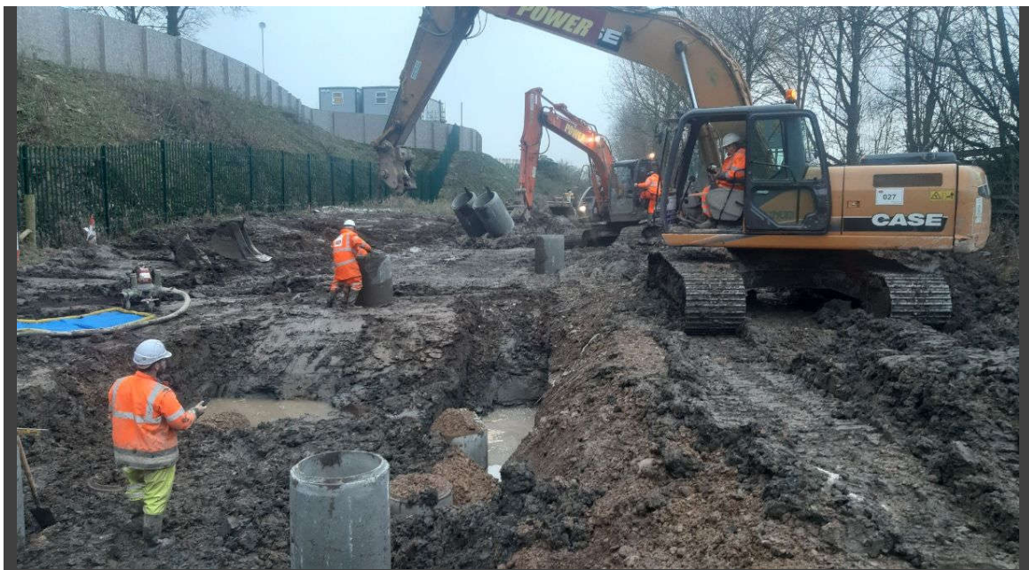
Dunkettle Interchange Upgrade: Ongoing works between the Pfizer northern boundary and the N25 National Primary Road