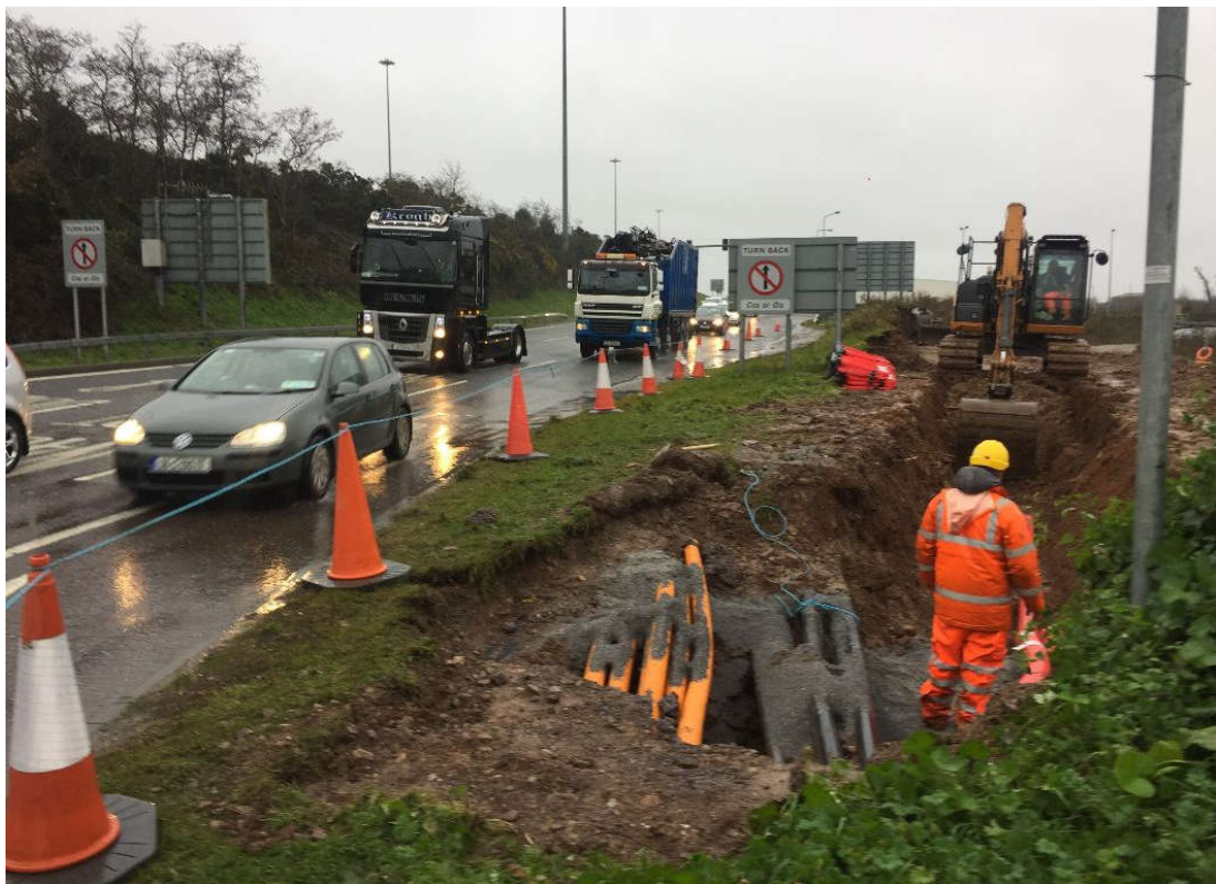
Dunkettle Interchange Upgrade: Service ducting installation southeast of Dunkettle Interchange