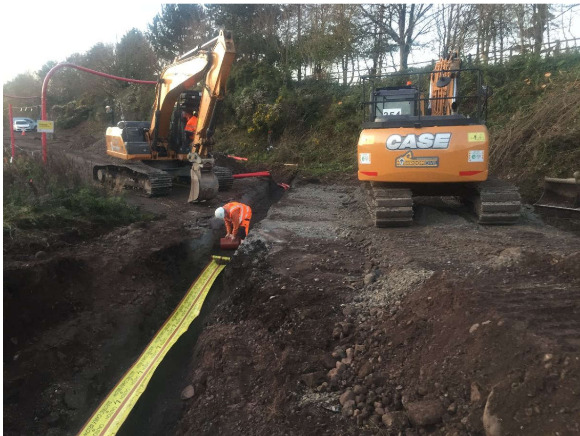
Dunkettle Interchange Upgrade: ESB diversion installation works east of M8