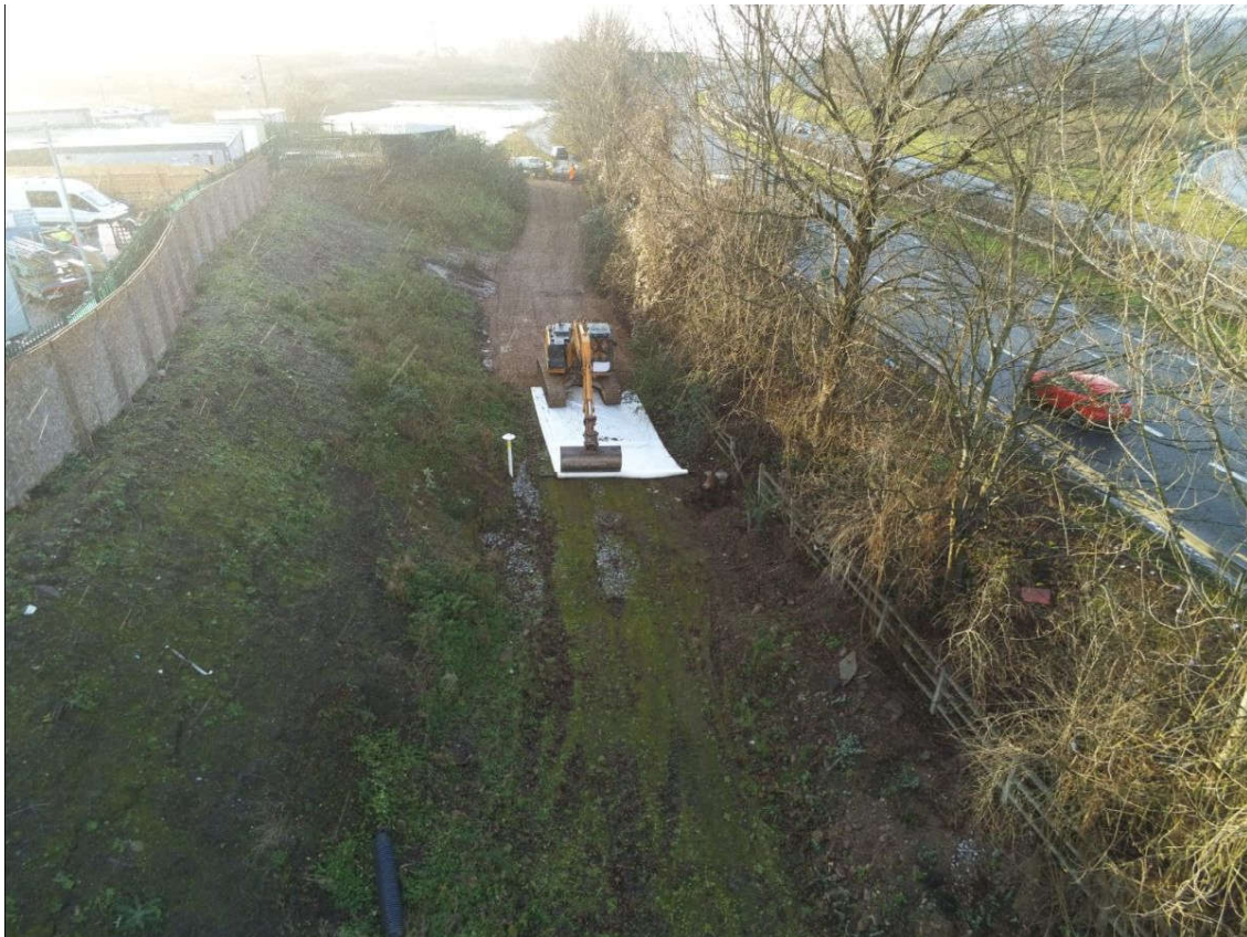
Dunkettle Interchange Upgrade: Access road construction, south of N25

Upgrade Dunkettle to a largely free-flow interchange to alleviate traffic congestion.