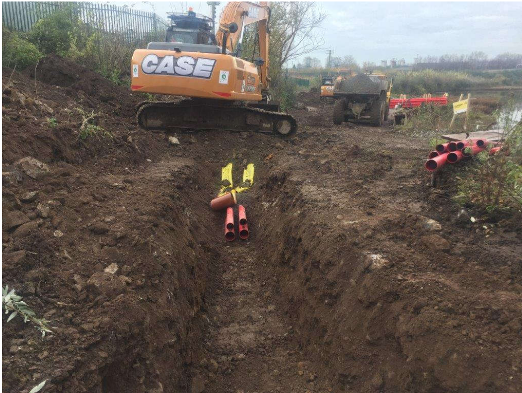
Dunkettle Interchange Upgrade: Installation works for ESB diversion