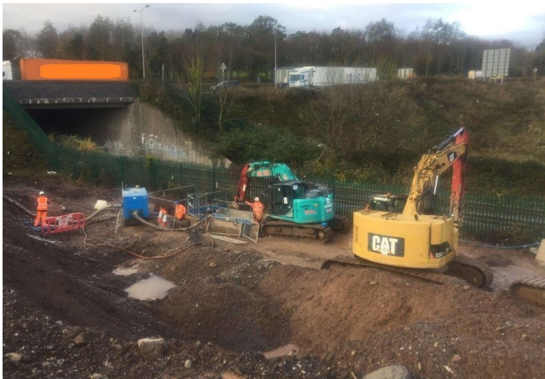
Dunkettle Interchange Upgrade: Watermain works continuing at North Esk