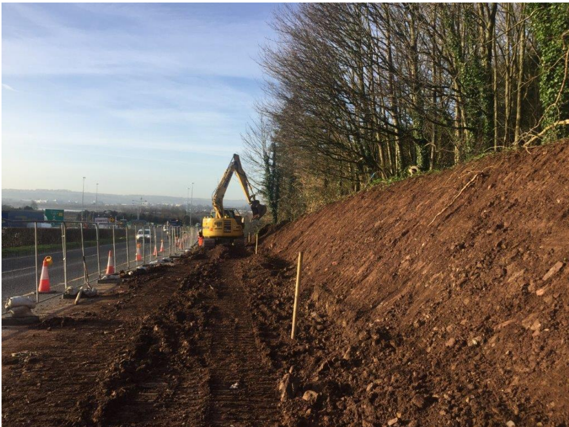
Dunkettle Interchange Upgrade: Works ongoing west of the M8 for the pedestrian/cycleway northern tie-in