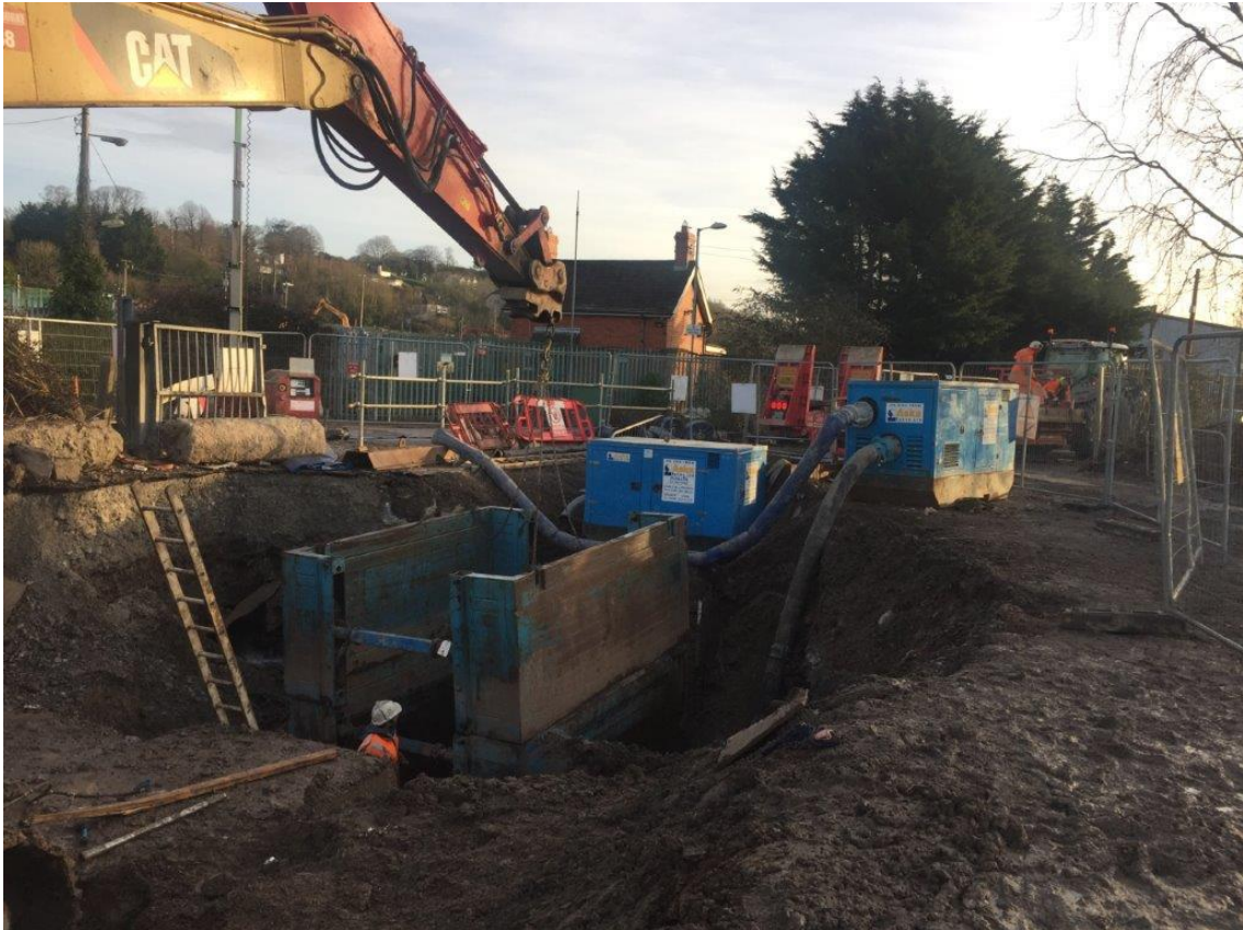
Dunkettle Interchange Upgrade: Watermain diversion works ongoing