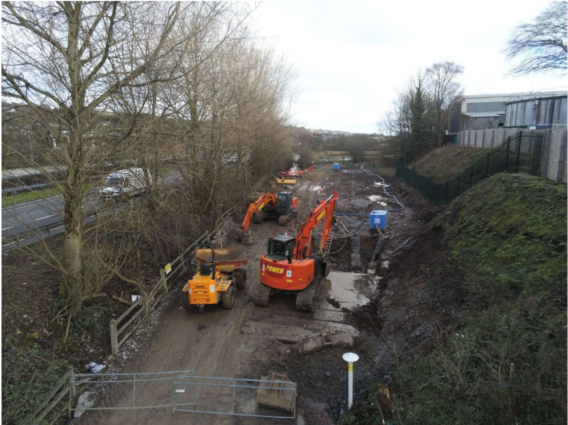
Dunkettle Interchange Upgrade: Works ongoing south of the N25, near the Pfizer boundary