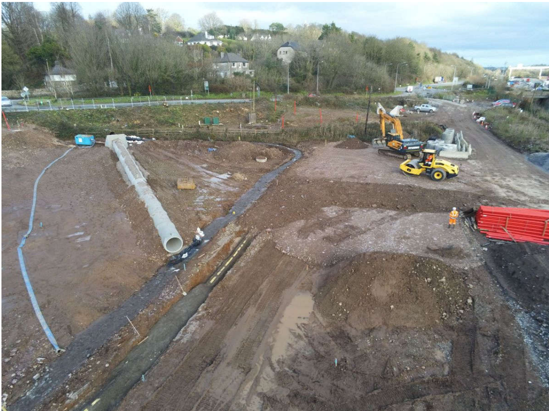
Dunkettle Interchange Upgrade: Watercourse diversion culvert near Gaelscoil Uí Drisceoil