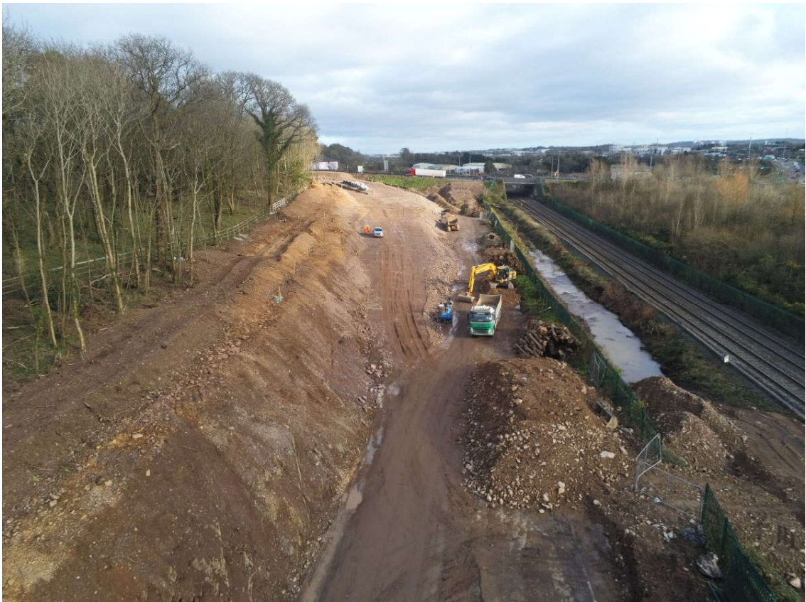
Dunkettle Interchange Upgrade: Works ongoing near the Cork-Midleton Railway line