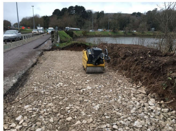
Dunkettle Interchange Upgrade: Parapet upgrade works and cycleway/ pedestrian walkway getting underway