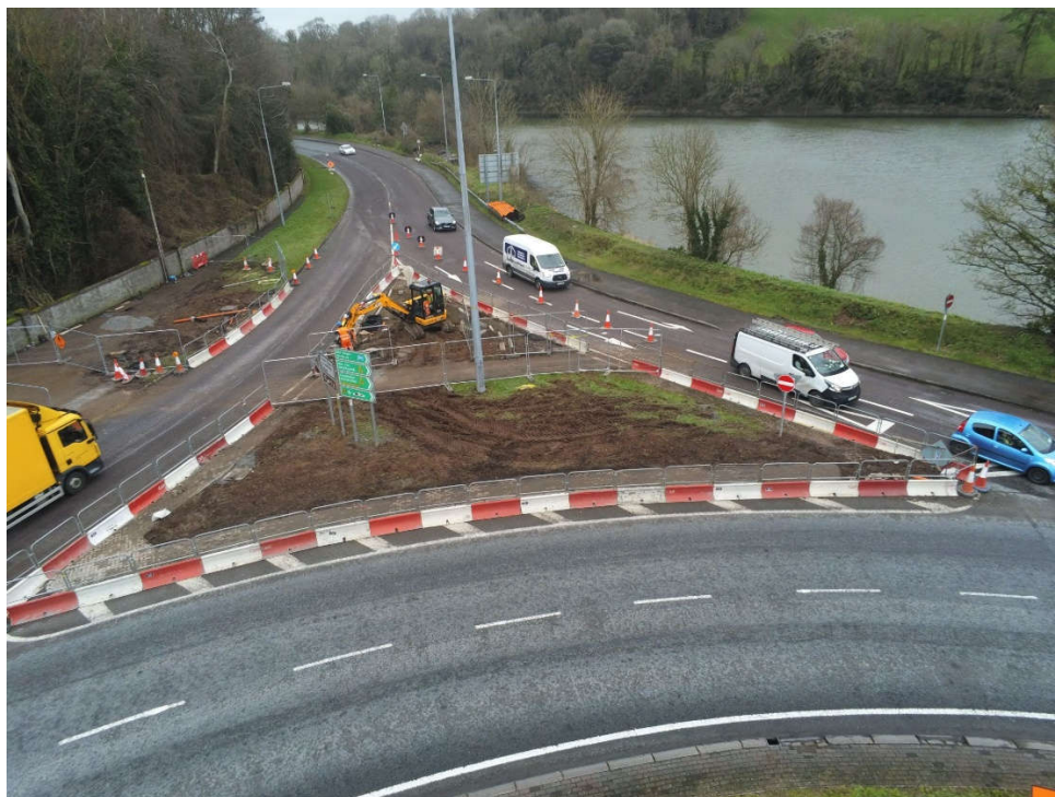
Dunkettle Interchange Upgrade: Works ongoing at the Dunkettle Roundabout (at end of Lower Glanmire Road)