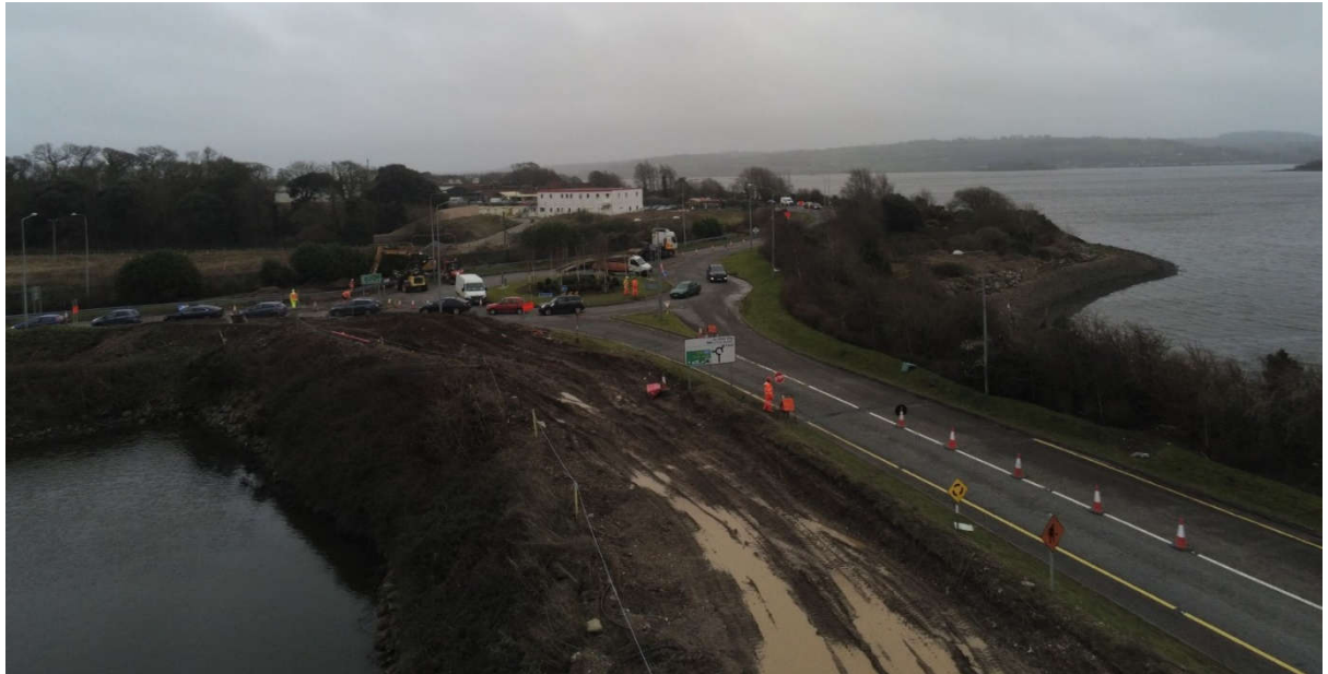
Dunkettle Interchange Upgrade: Installation of service ducting on the R623 Little Island, with the Dunkettle Site Office visible in the background