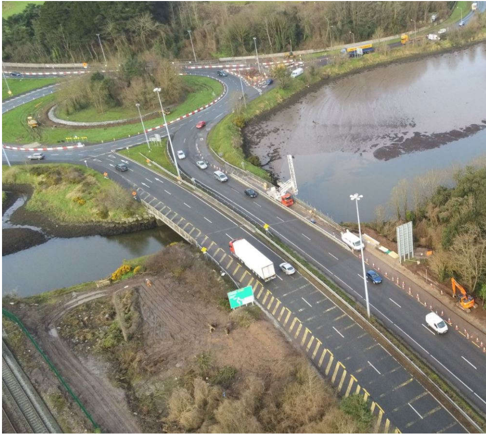
Ongoing works at Dunkettle Roundabout and Glashaboy River Bridge