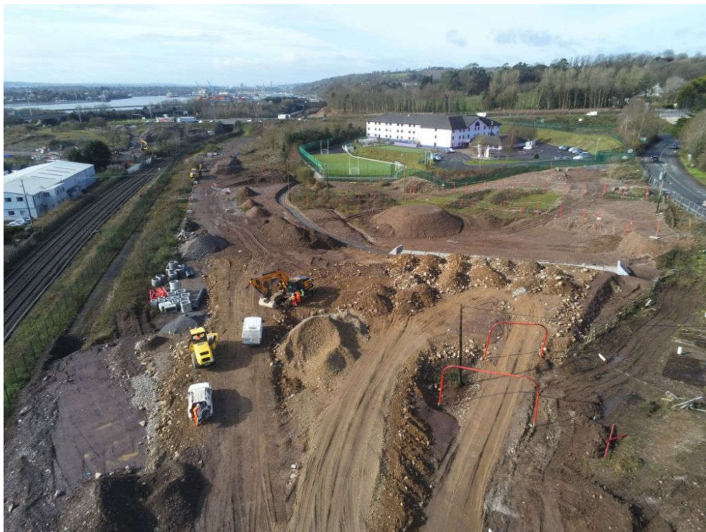
Embankment construction and drainage works south of Gaelscoil Uí Drisceoil