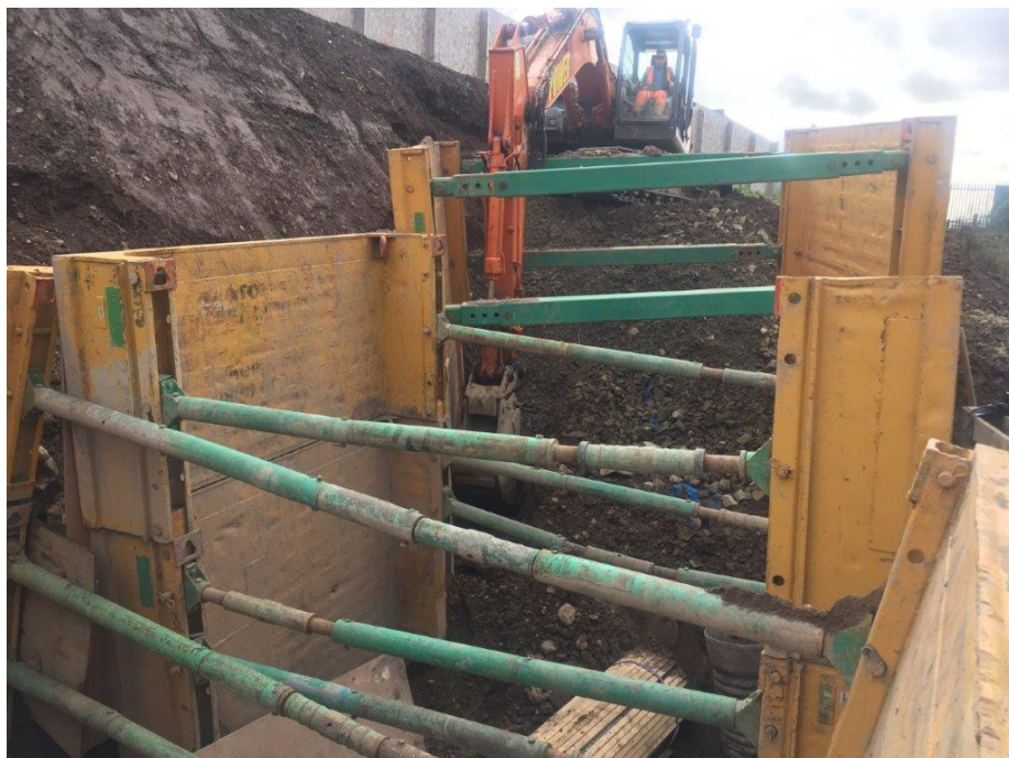
Works associated with repairs to existing gas transmission main