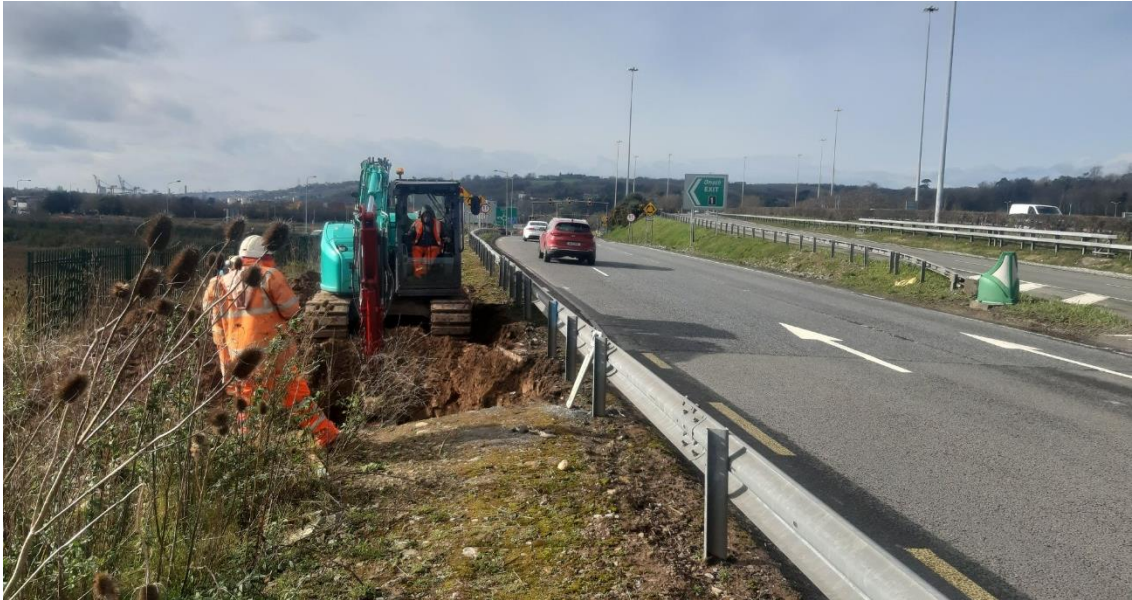
Trial pit to determine the location of the existing 900mm watermain adjacent to the N25