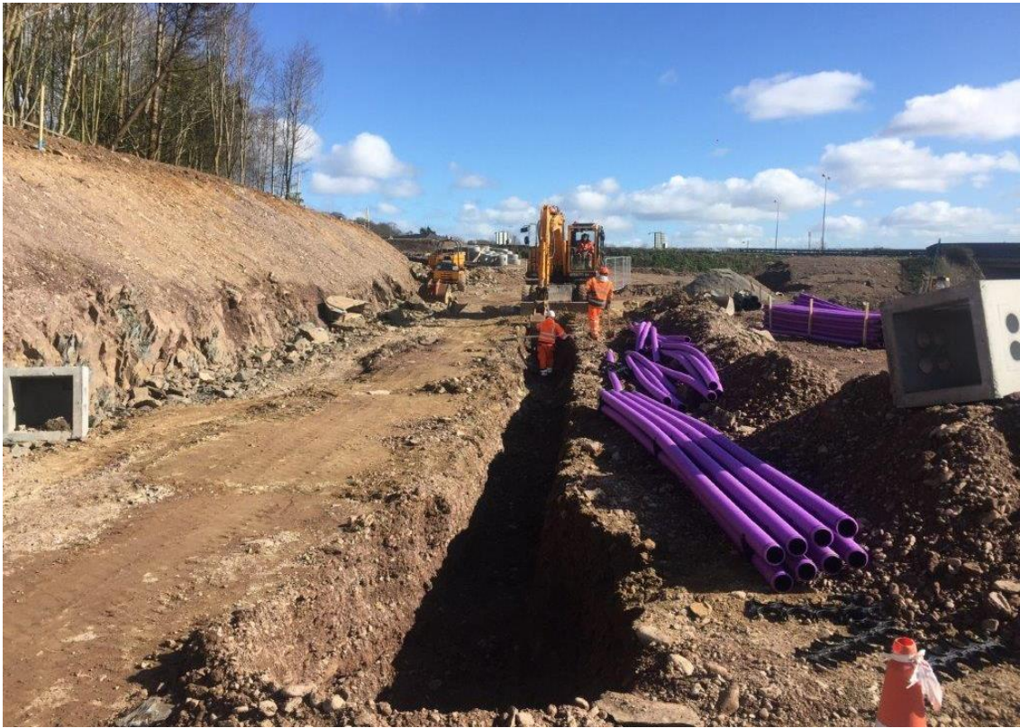
Installation of communications ducting