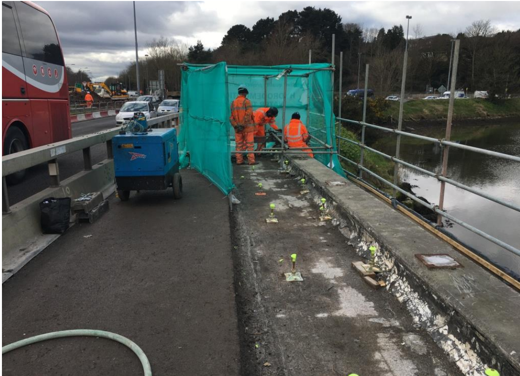
Works commencing on the upgrade to the existing parapet at the Glashaboy River Bridge