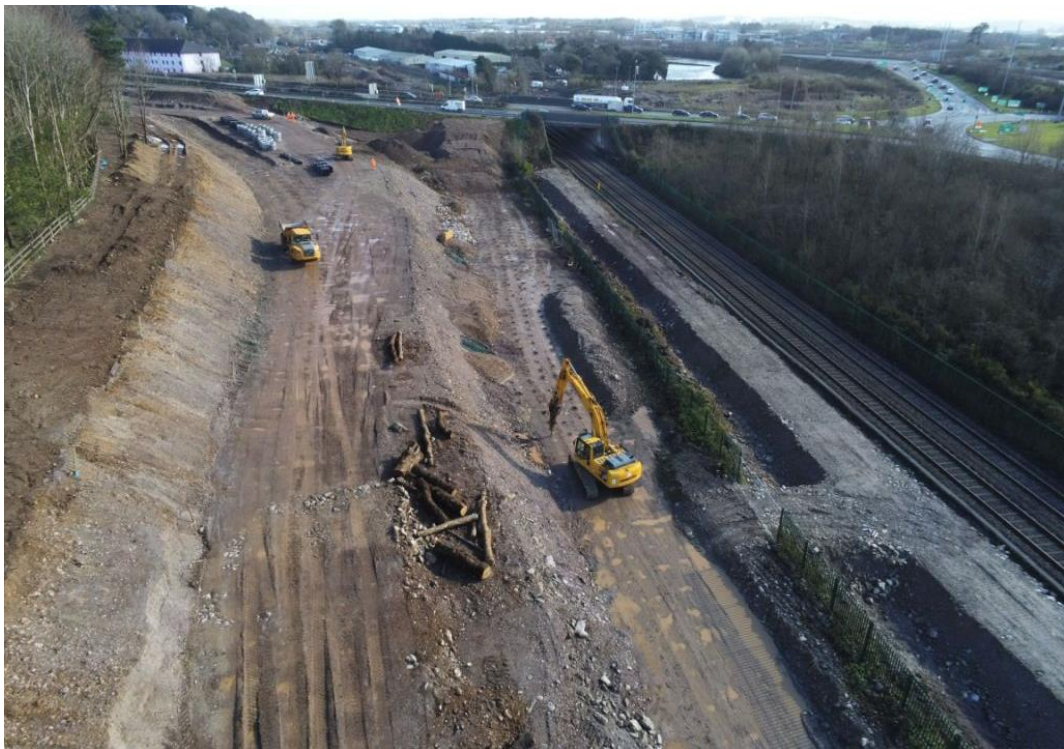
Works on the proposed free flow slip road from the N8 eastbound to the M8 northbound