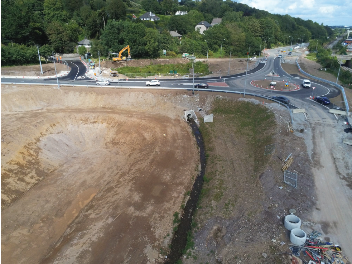
Realigned Dunkettle local road and Factory Hill