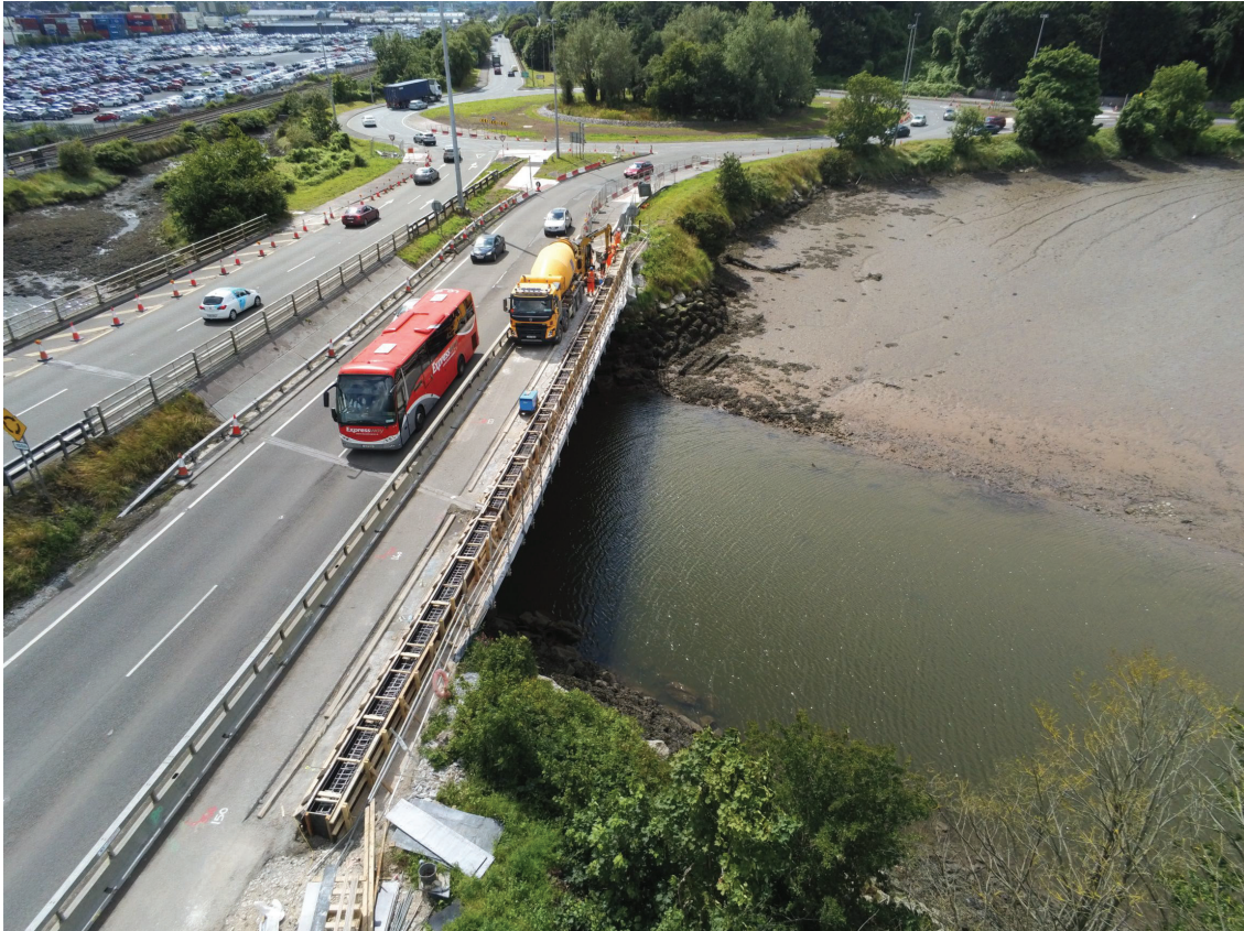
Replacement bridge parapets under construction at Dunkettle River bridge