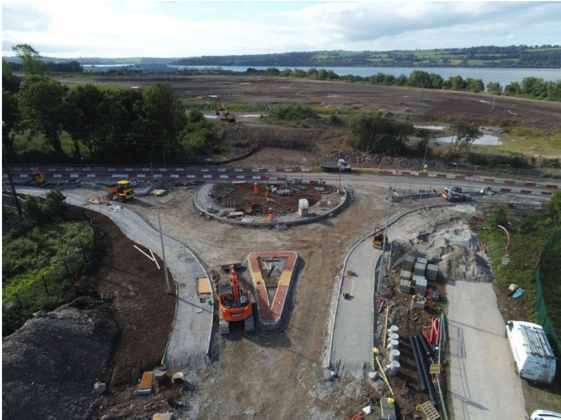
R623 Roundabout area, north side being prepared for final surfacing

The R623 Roundabout will be brought fully into use when it is completed. The roundabout will provide a key access point for the upgrade works required in the area south of the N25 over the coming period.