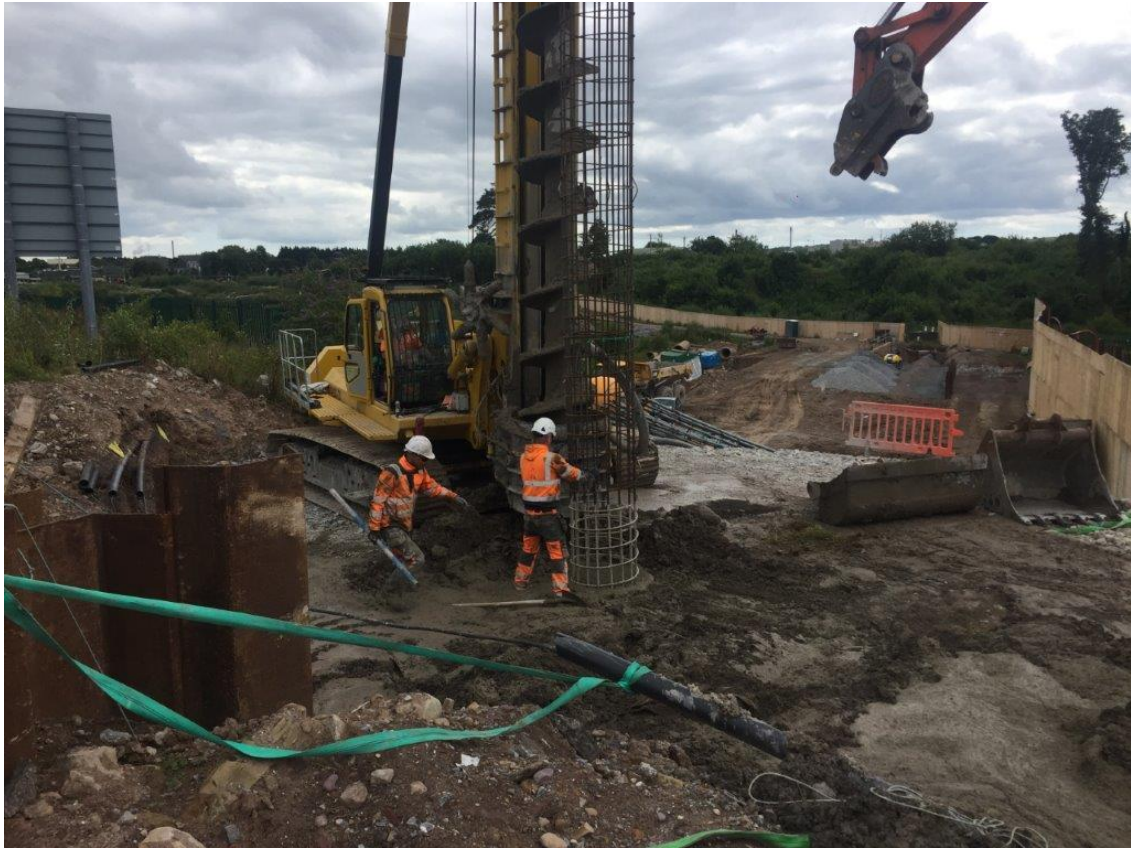
Steel reinforcement being installed in a freshly poured concrete pile