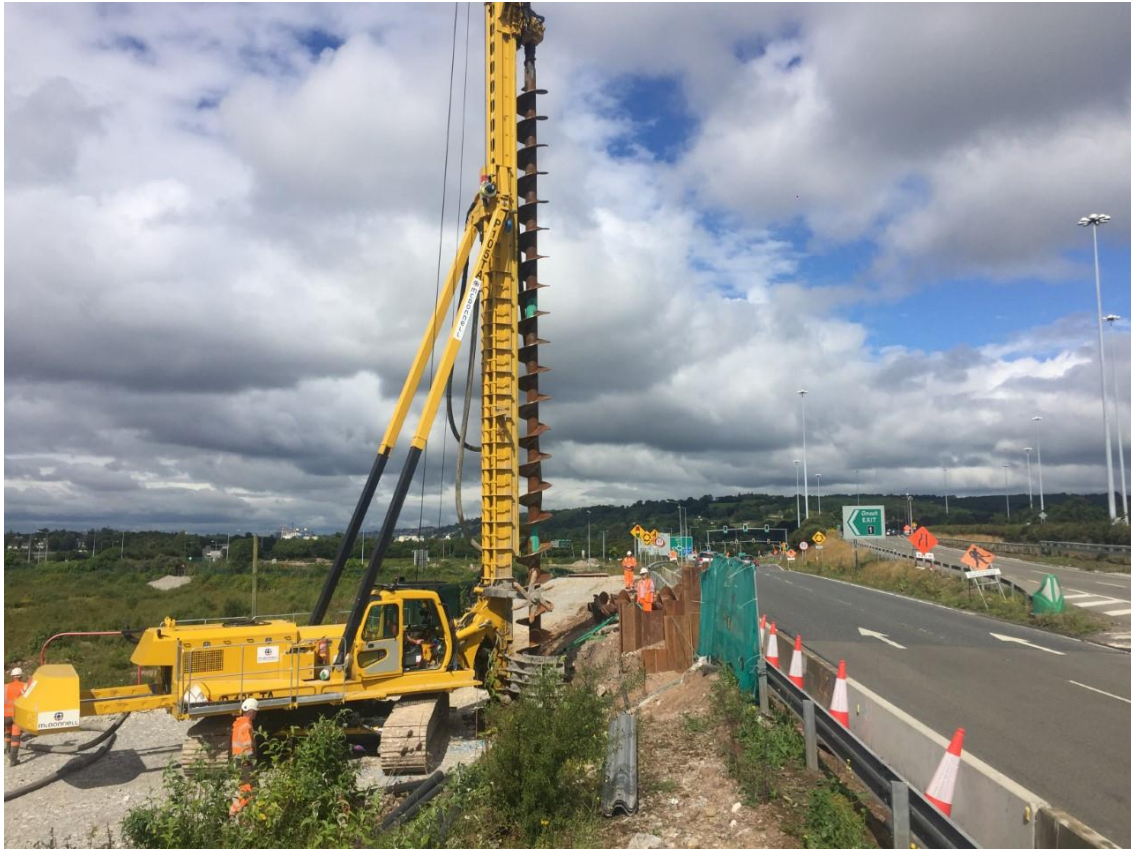
Piling works ongoing adjacent to the N25