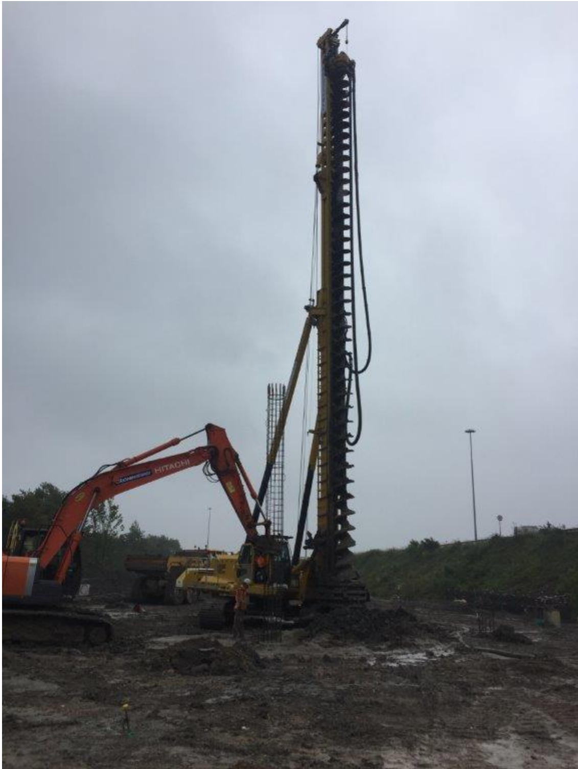
Reinforcing steel being installed as part of the construction of reinforced concrete piled supports, north of the N25.