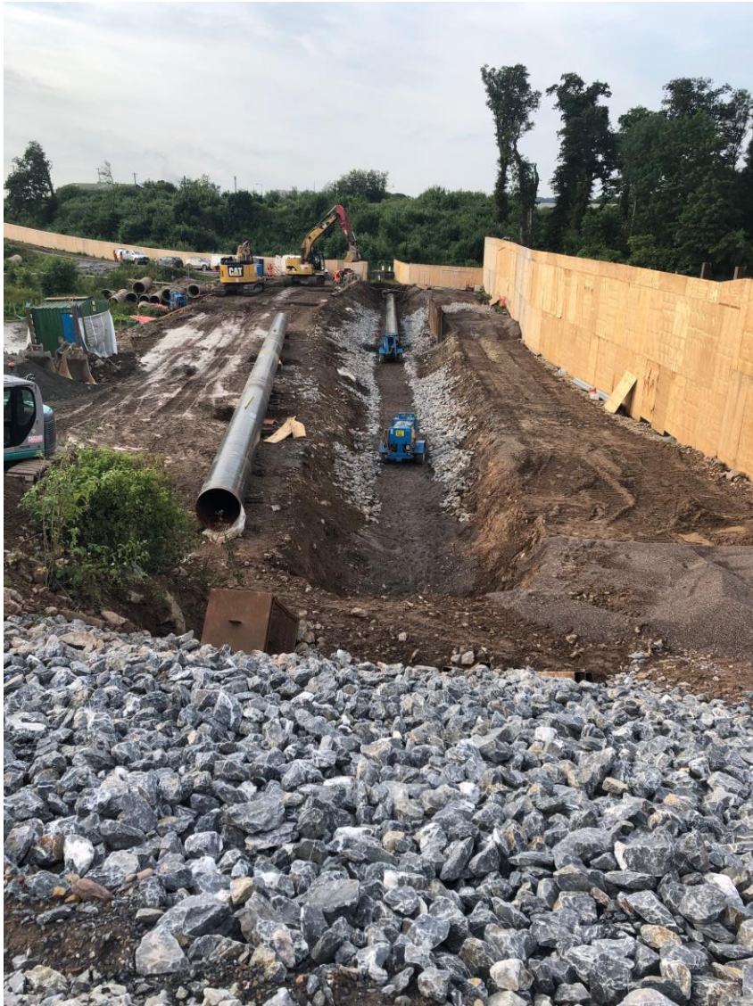
Watermain installation works ongoing south of the N25.