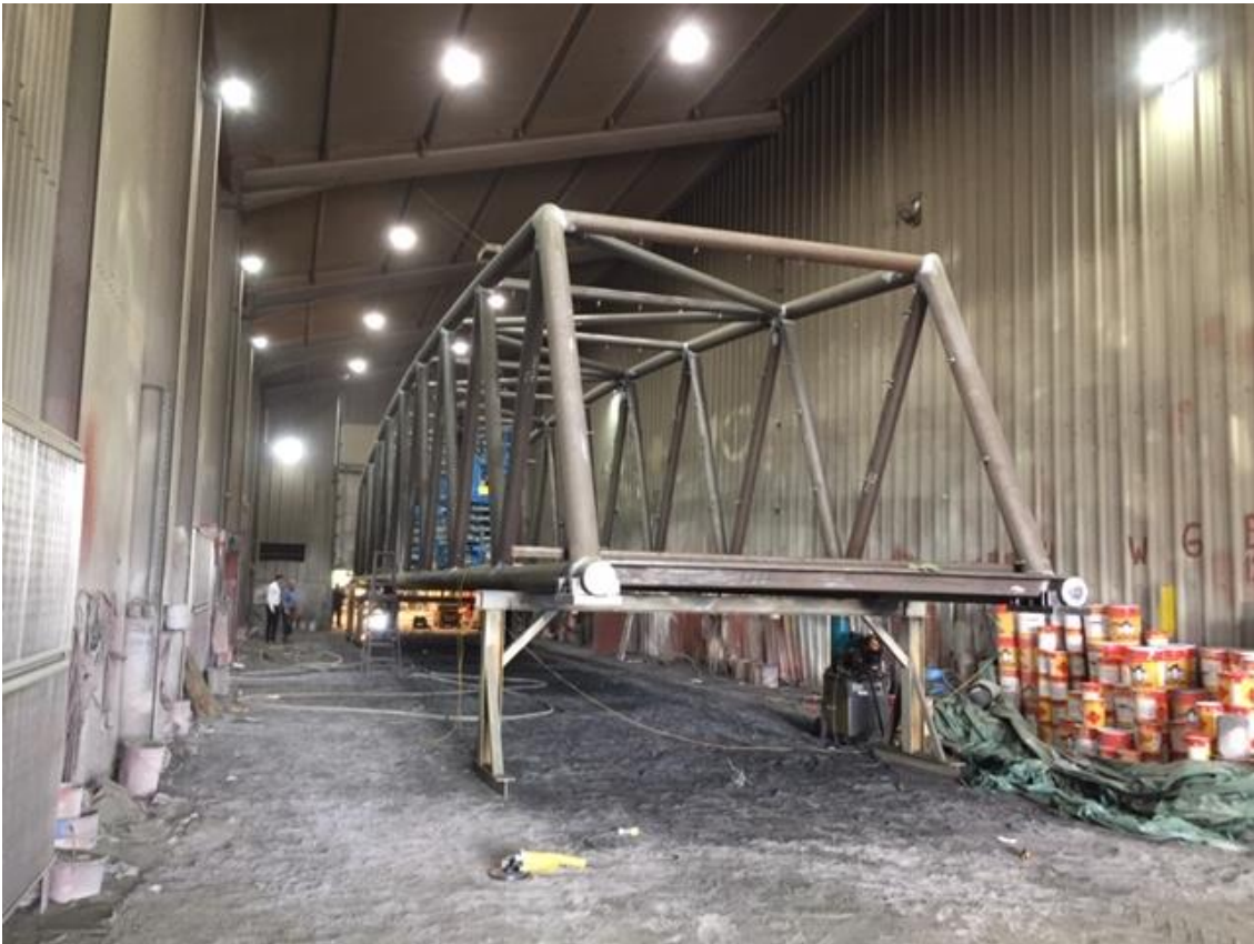
Off-site fabrication works continuing in association with the proposed new cycleway/pedestrian railway bridge.

The bridge structure is being fabricated off-site – see photograph below.