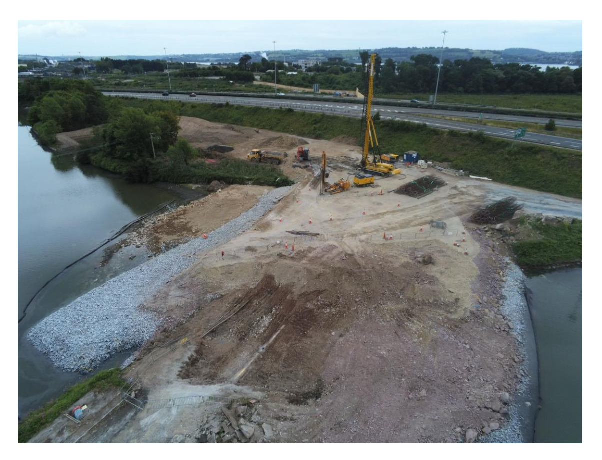
Piling rig operational in the North Esk area immediately north of the N25.

Works are also continuing in association with signalising of the existing Dunkettle Roundabout and the earthworks element of the N8 to M8 northbound free flow slip road are nearing completion. See photograph below.