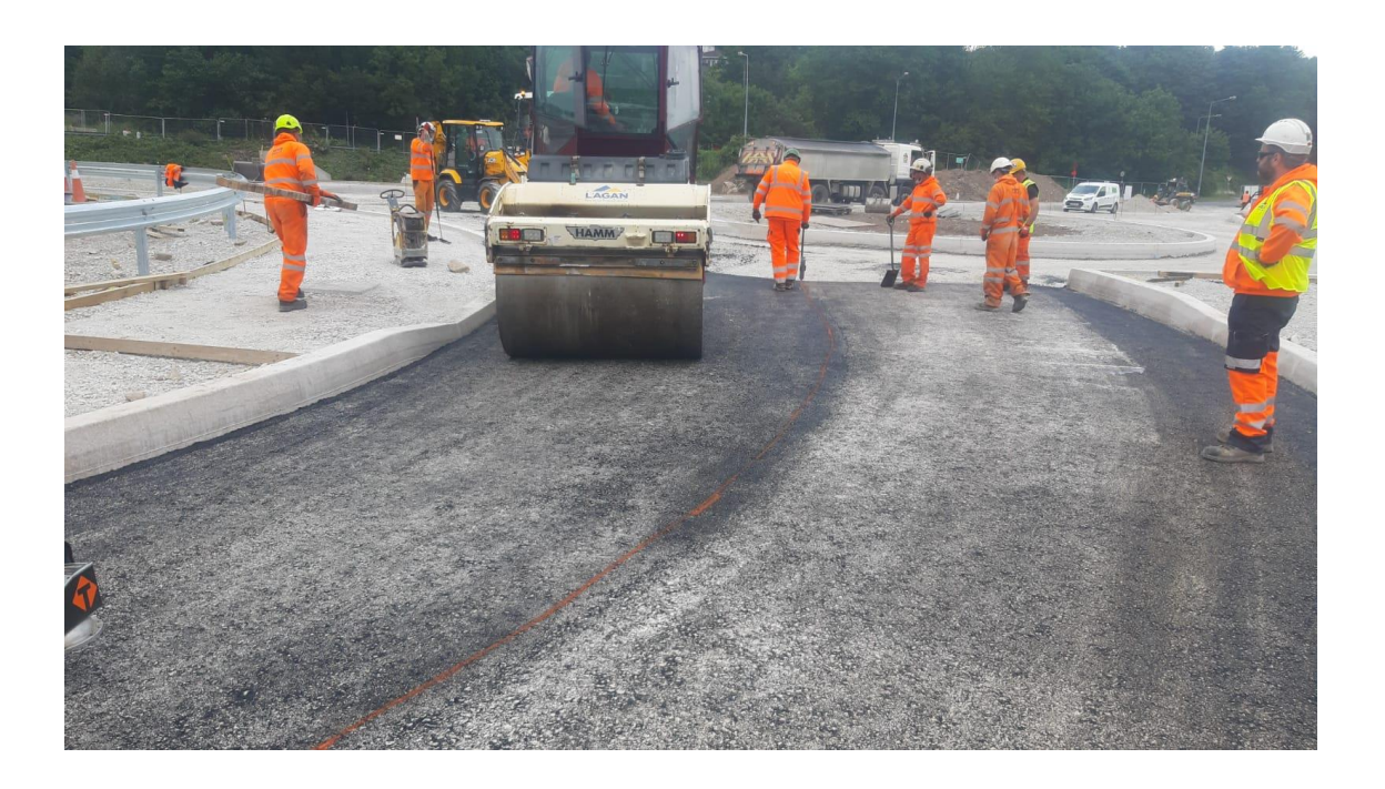
Surface works underway at the new Dunkettle local road Roundabout.

The localised diversions in this area will cause some limited disruption to local traffic but we hope to mitigate this impact by completing the works as quickly as possible.