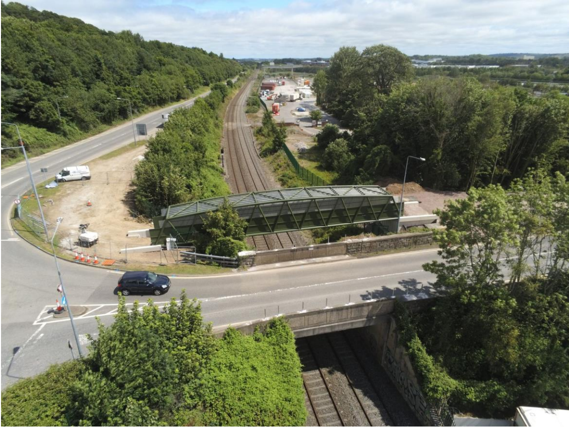
Aerial shot of the new structure spanning the Cork/Midleton railway line