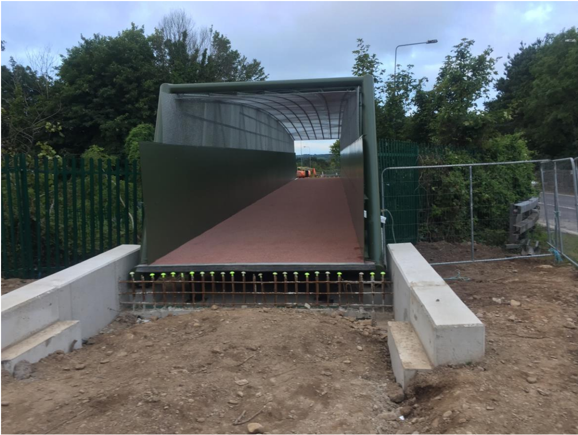
New structure in place with extent of finishing works required clearly apparent