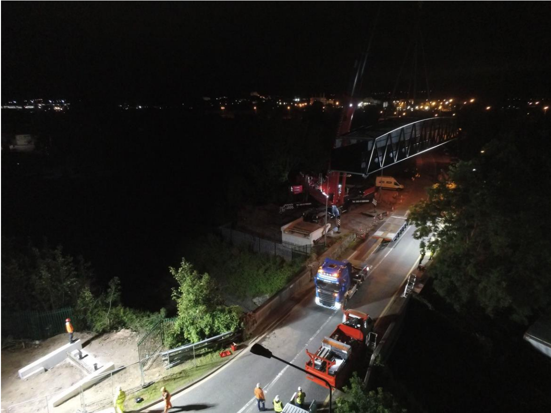
Prefabricated bridge structure being lifted into place

Island area will be included in next week's update. See photographs below.