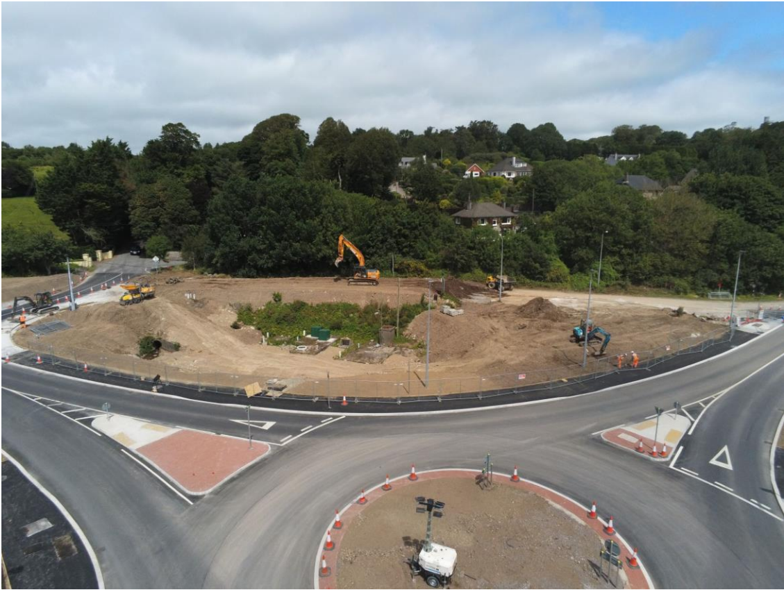
Landscaping works ongoing on the old Dunkettle local road near Factory Hill junction