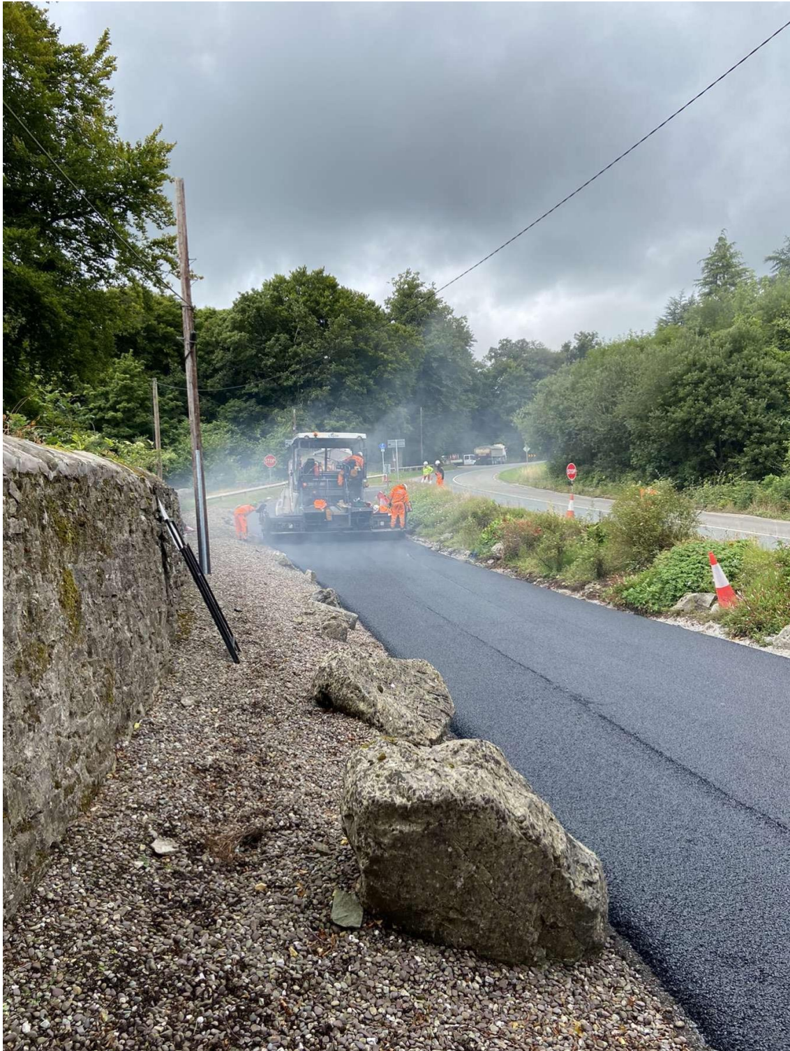
Surfacing works nearing completion on the Dunkettle cul-de-sac road