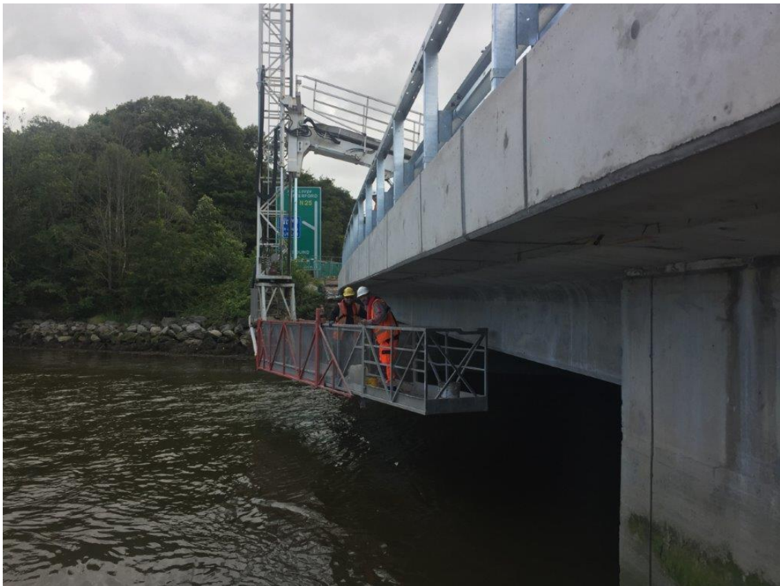
Hoist operating to facilitate operatives in gaining access to the underside of the river bridge