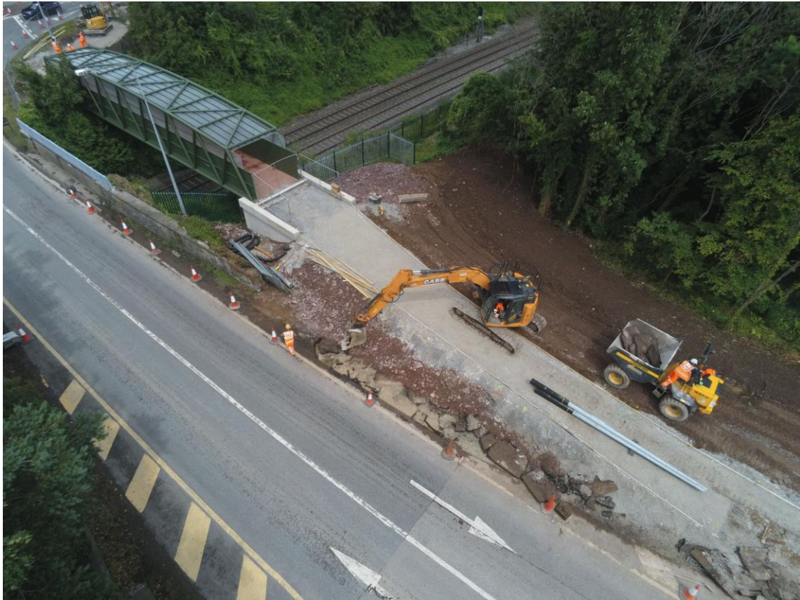
Works ongoing on completion of the approach rampS to the new pedestrian/cycleway railway bridge, near the existing Bury's Bridge