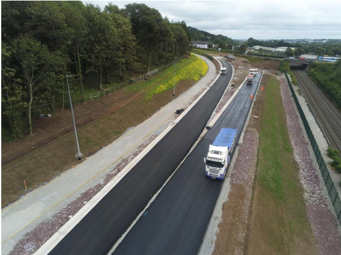
Resurfacing works progressing northwest of the existing Dunkettle Interchange Roundabout