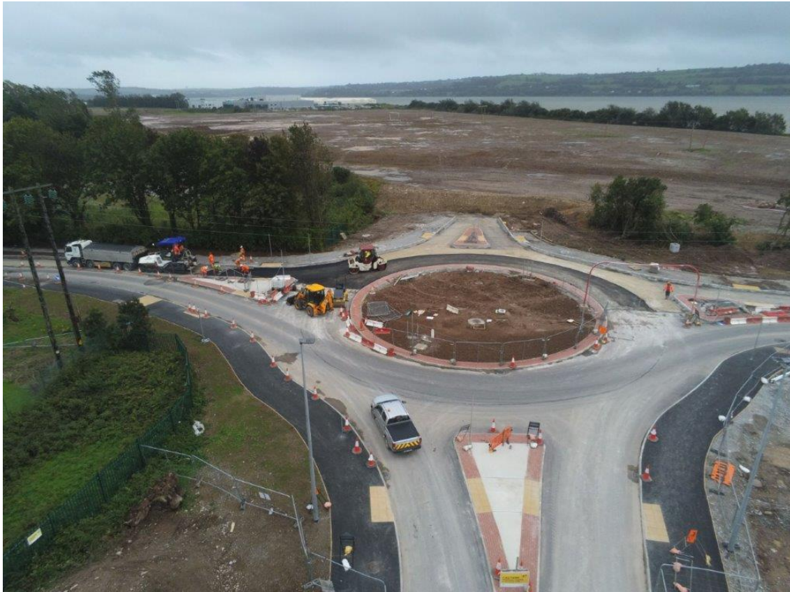
Ongoing works at new R623 Roundabout, Little Island.