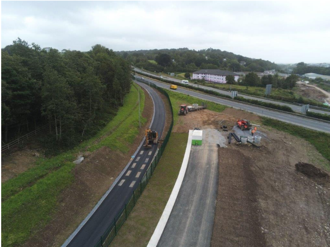
View of new N8-M8 link, looking North, with segregated cycleway, and Gaelscoil in the background