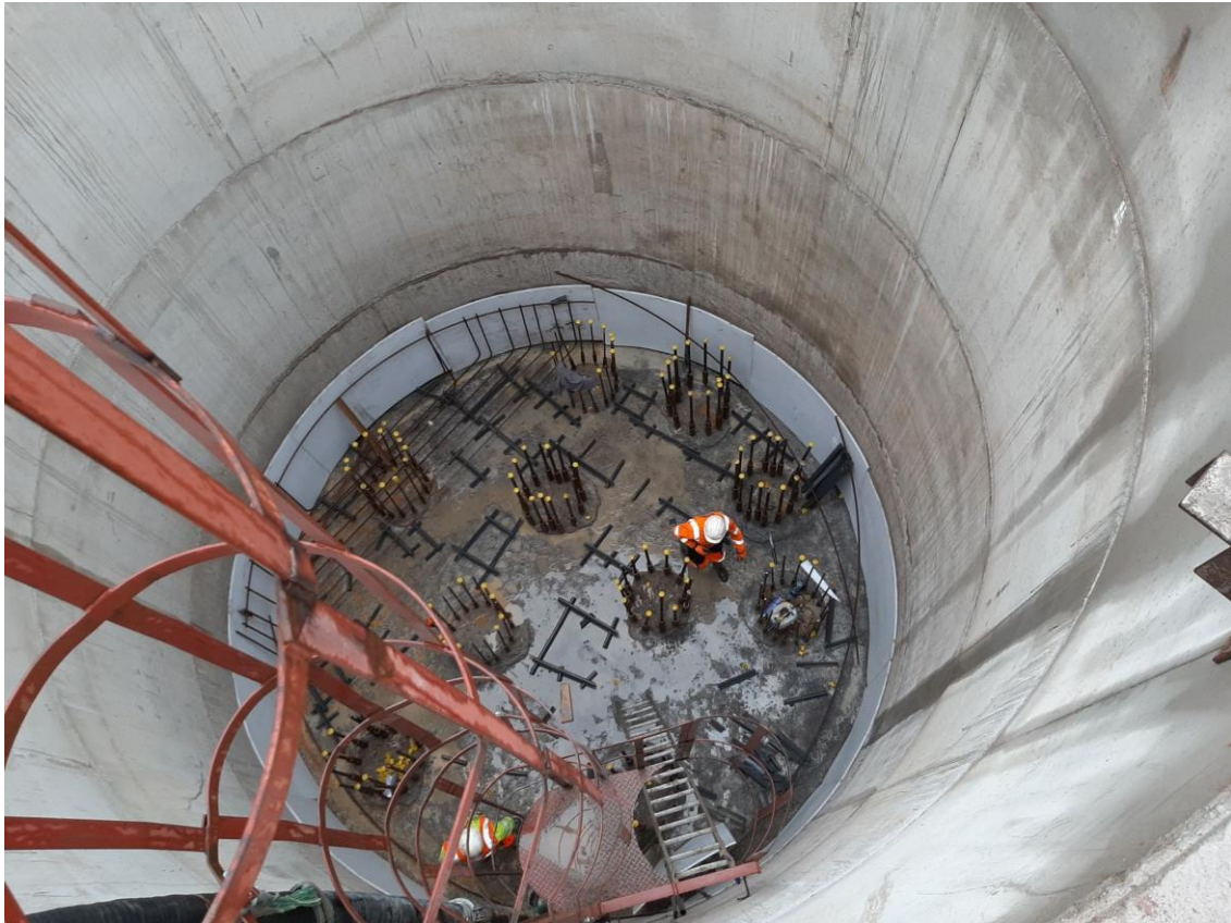
Vertical shot of the concrete caisson near the N25 diverge. This structure is well over 20 feet deep

Significant traffic management measures will be required at this location over the weekend of Friday 11 th September 2020 with one lane of the diverge being closed from 10.00 am on Friday 11 th . Details of weekend working arrangements at this location will be provided in next week's update.