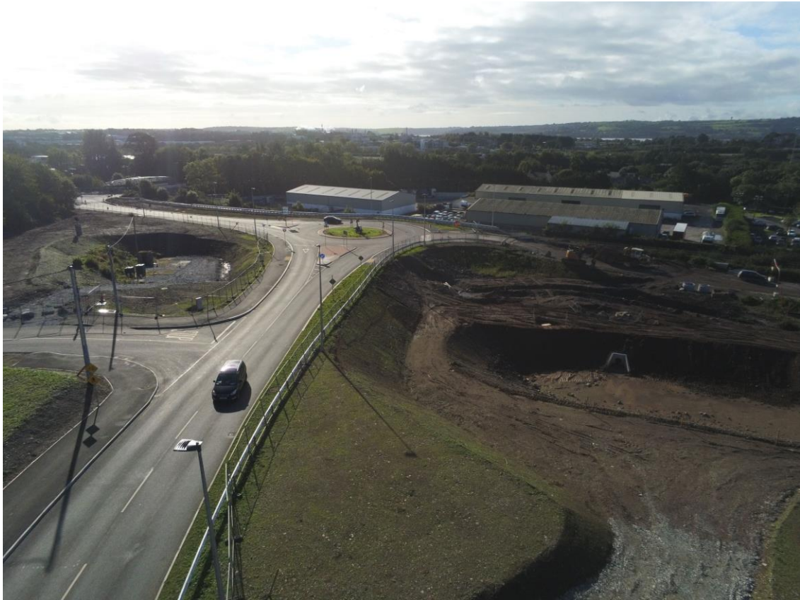
Composite aerial shot of the new local road layout with the Bury's Bridge roundabout in the background