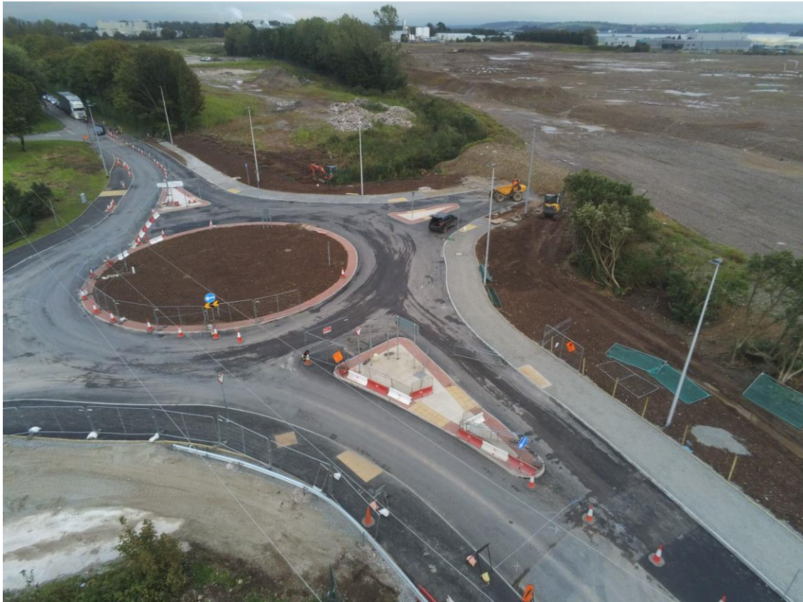
Aerial shot of the recently completed R623 roundabout