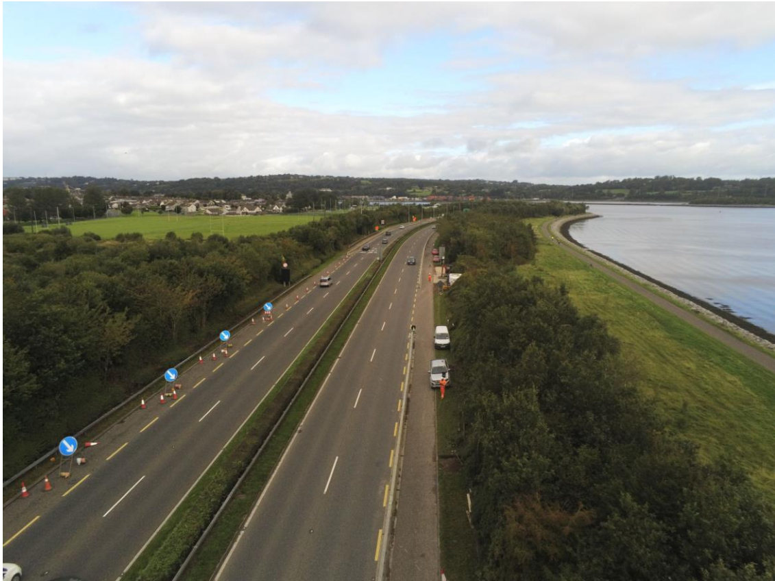
Aerial view of the recently installed hard shoulder closures on the N40