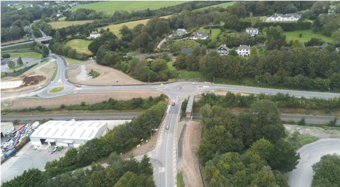
Composite view of the new local road network in the Bury's Bridge area