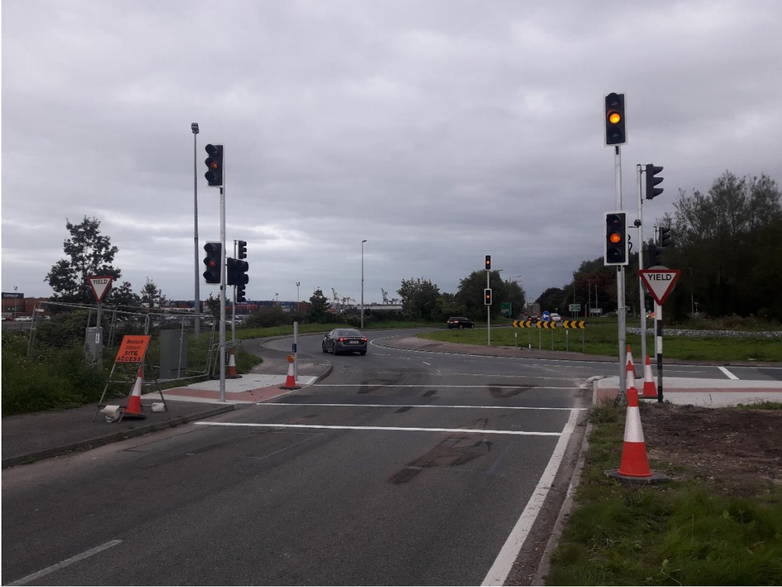
Dunkettle Roundabout traffic lights supplied with power