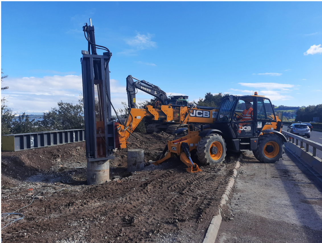
Pile testing underway on the N40 Westbound immediately South of the Jack Lynch Tunnel.