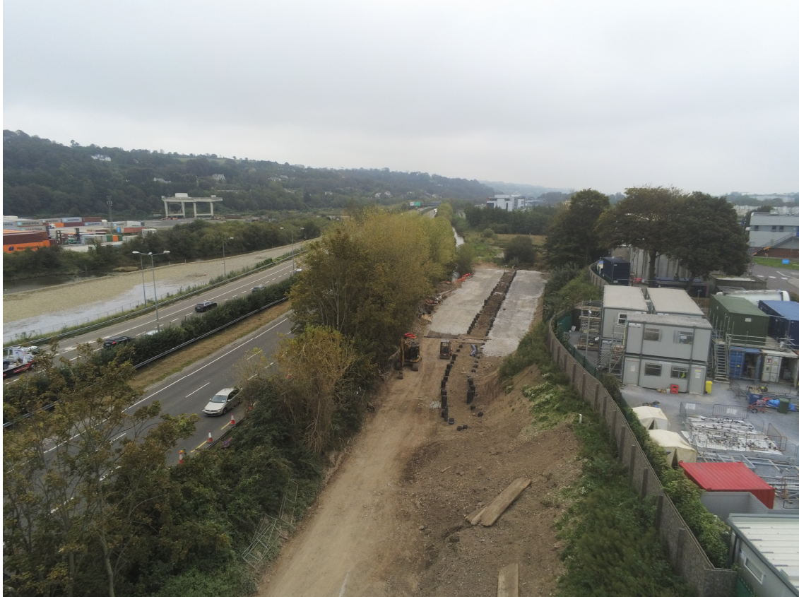
Preparatory works for piling nearing completion.

these works will continue for a number of months and details/updates will be provided as the works progress. See photograph below.