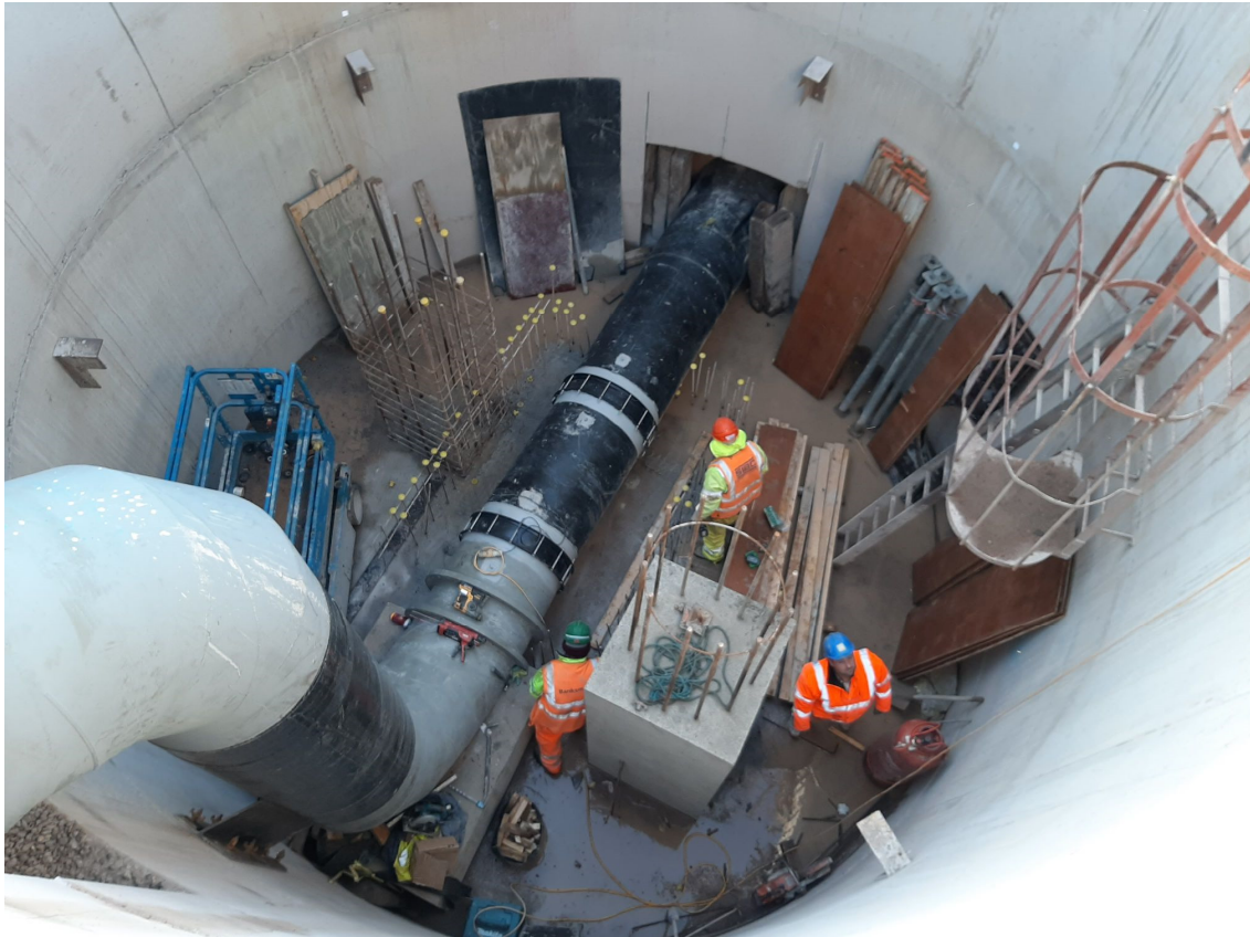
Pipe installation works including pipe welding being progressed in the concrete caisson immediately south of the N25 westbound diverge.