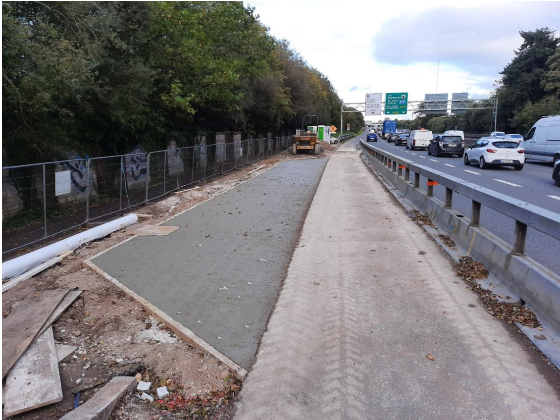
Lay-by under construction adjoining the N40 eastbound