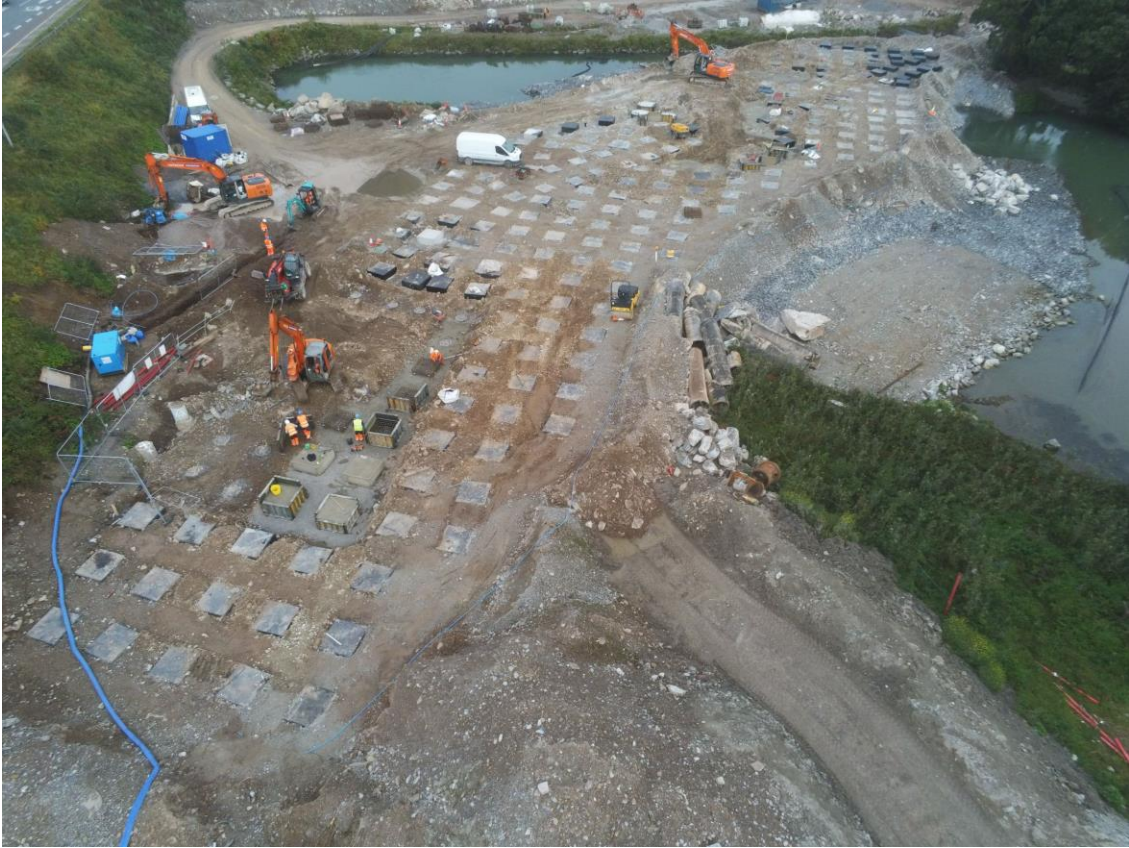
Aerial shot of watermain finishing works at North Esk