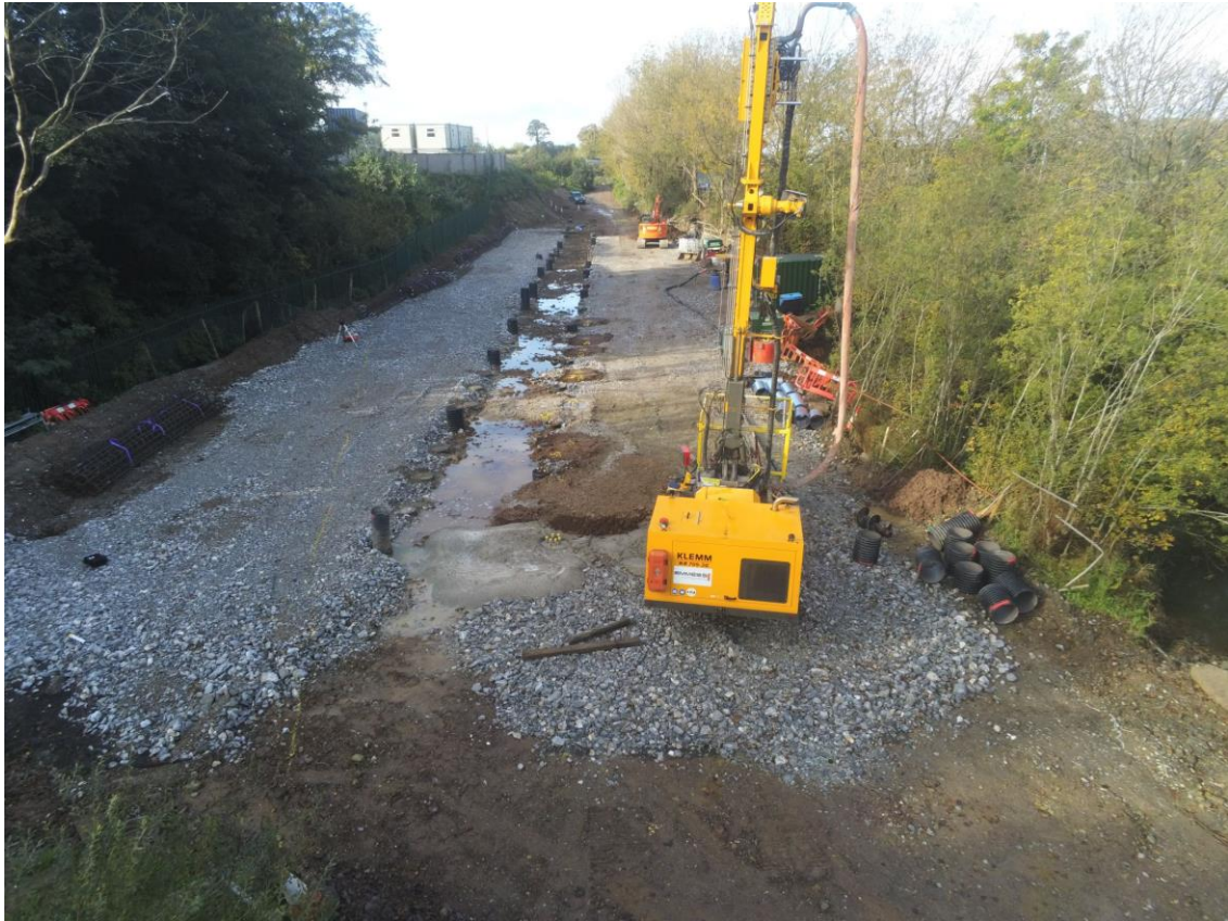
Photograph of piling rig moving into position at the gas transmission main area