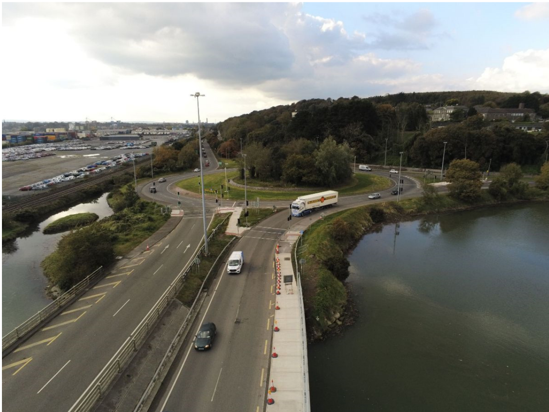
Dunkettle Roundabout taken from the Glashaboy River direction