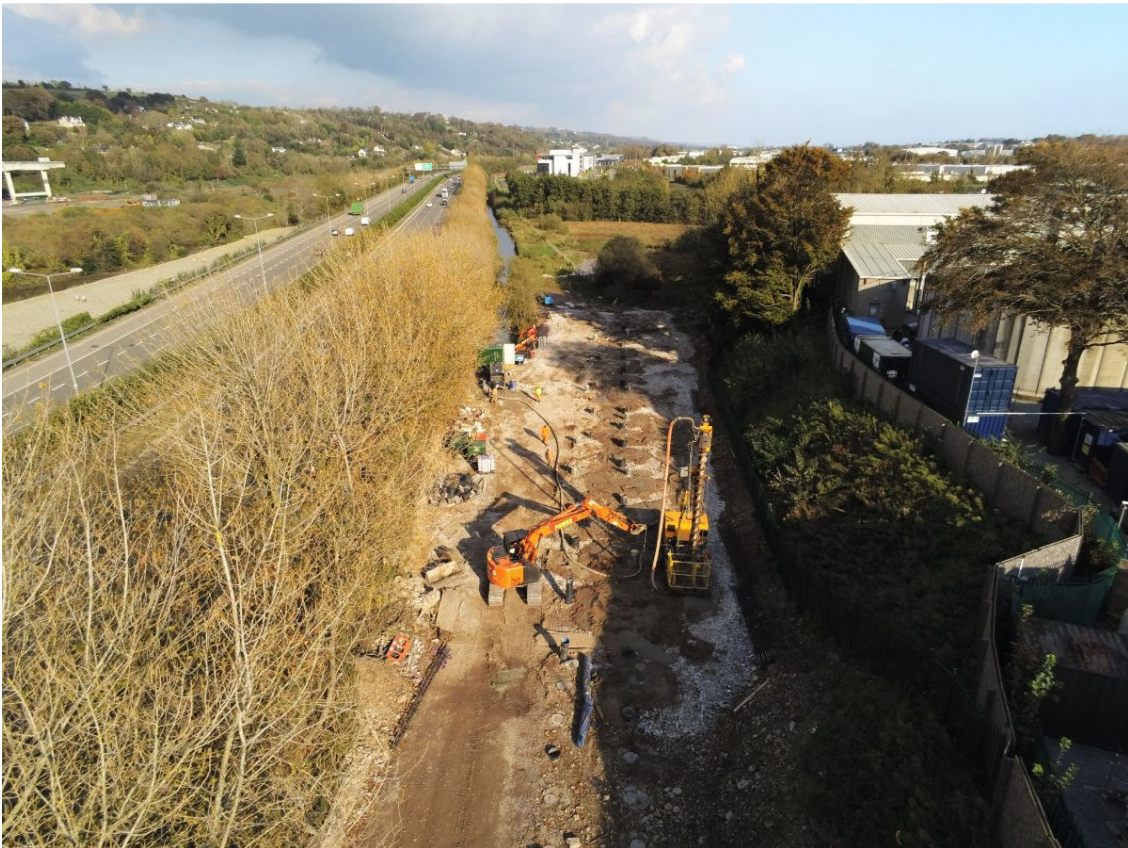
Piling works ongoing in an area immediately south of the N25 westbound lanes