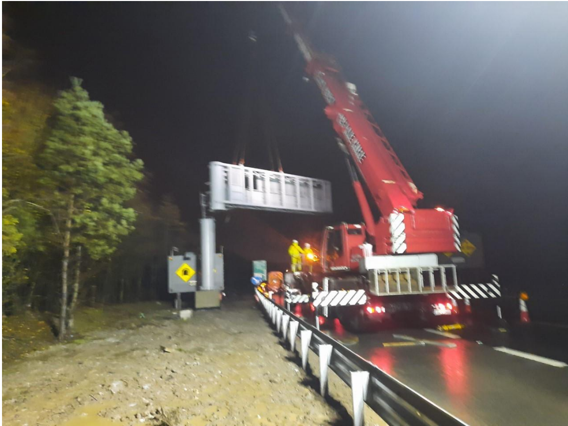
Support steel being installed under night time working on the N40 eastbound in the area of Bloomfield Interchange