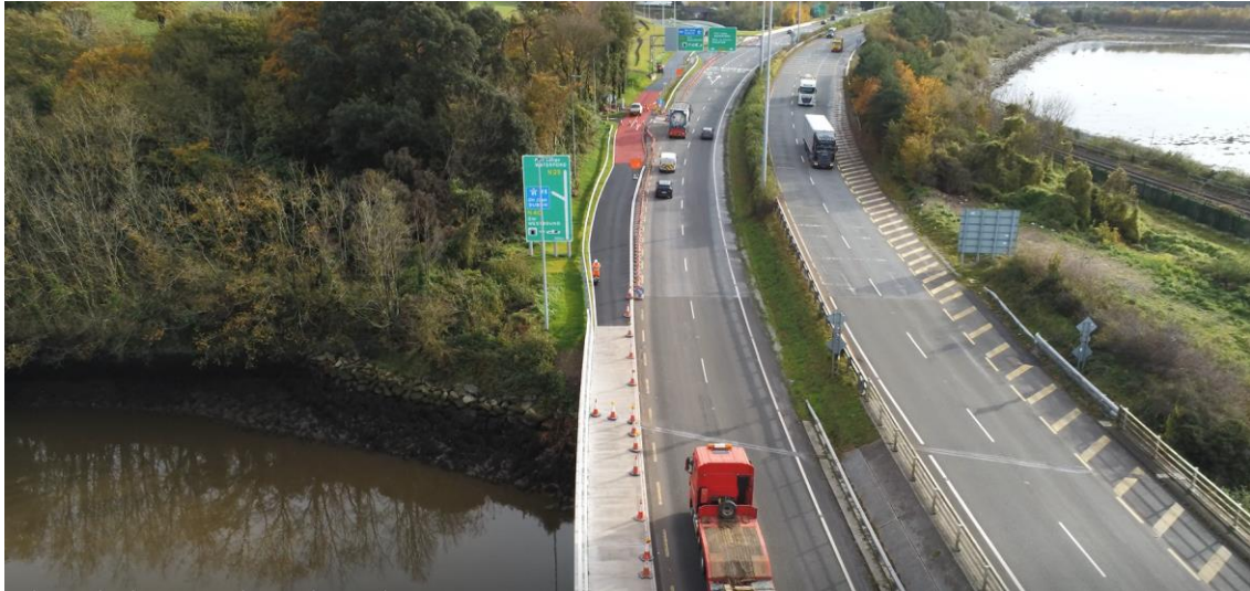
View of the new footway/cycleway facing east from the Glashaboy River