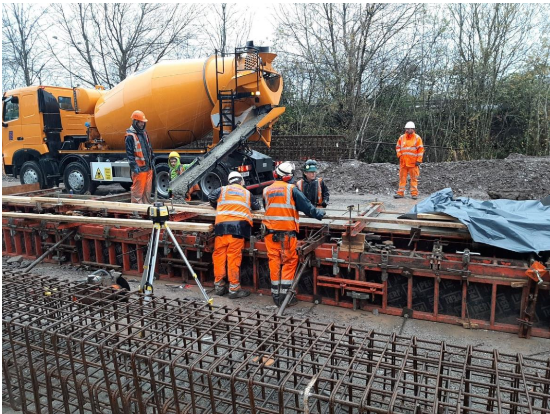
Reinforcement steel in place in preparation for concrete pour at the gas transmission main site