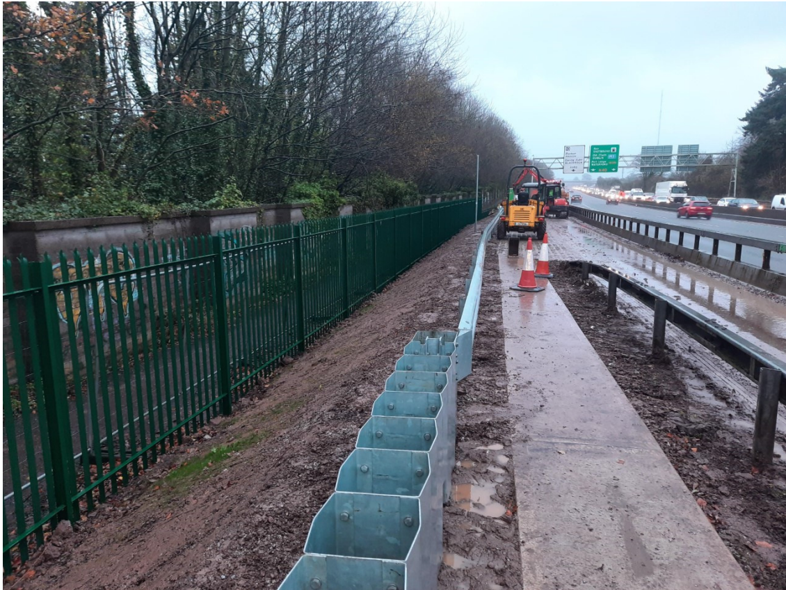
Permanent safety barrier being erected behind a temporary safety barrier adjoining the N40 eastbound at Bloomfield