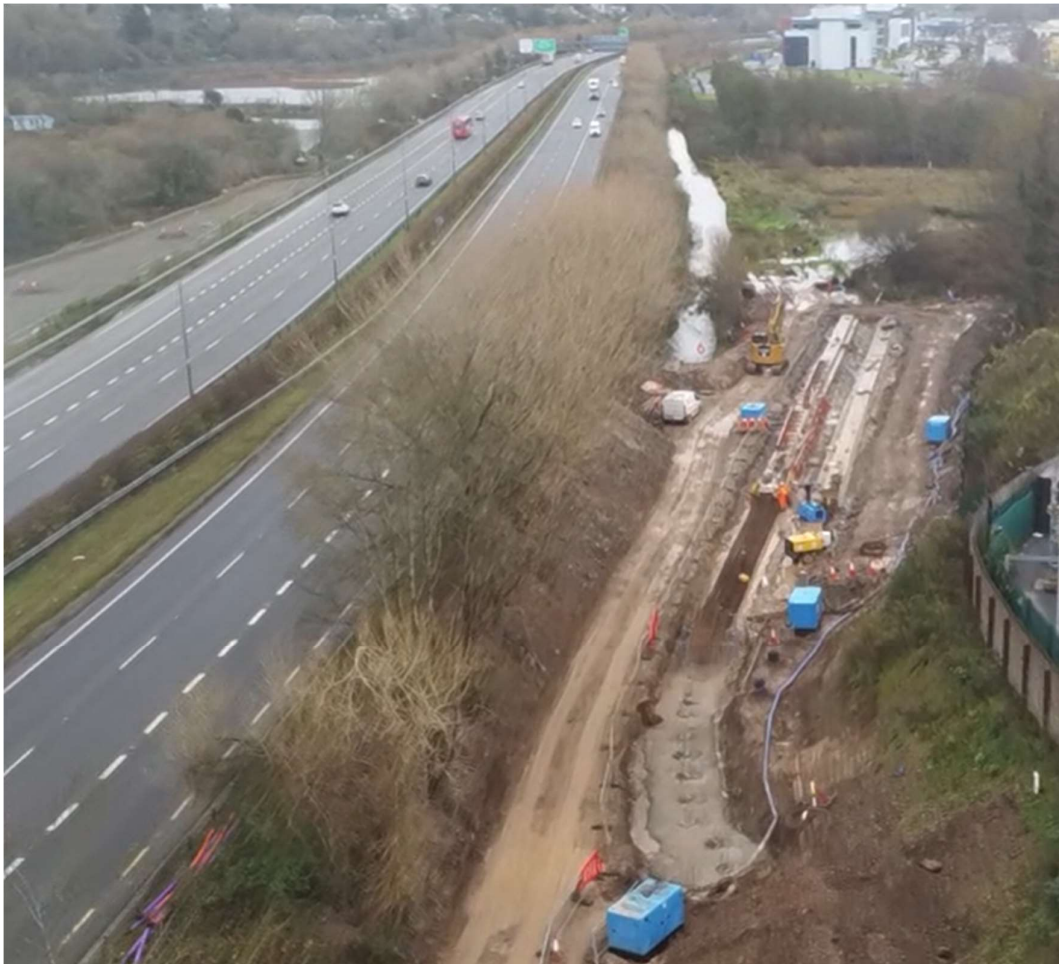
Concrete protection slab installation works ongoing at the gas transmission main location