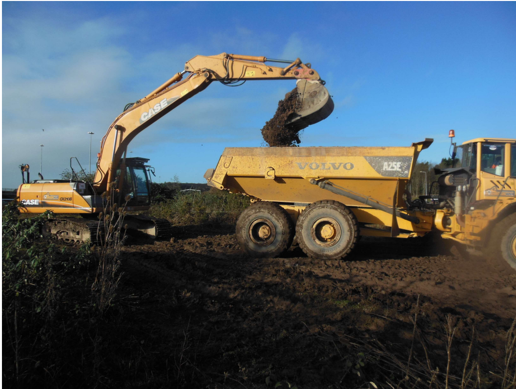
Site clearance works ongoing near the northeast corner of Dunkettle Interchange Roundabout