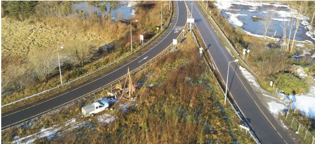
Ground investigation rig progressing an assessment of ground conditions at depth in the Bury's Bridge area