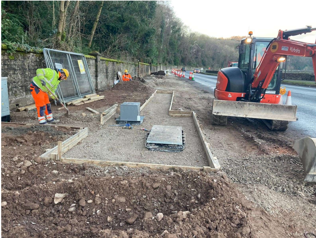
Ongoing ITS works on the Glanmire Regional Road