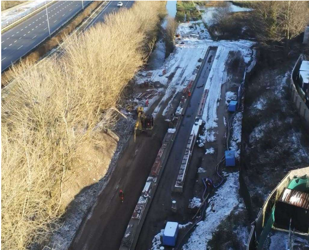
Preparations for placing of protective slabs nearing completion, south of the N25