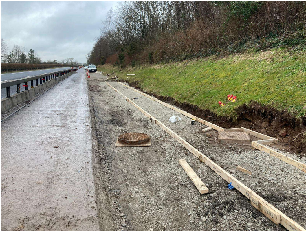
Civil works getting underway in the grass verge of the M8 southbound, between the Glanmire Junction and the Dunkettle Interchange