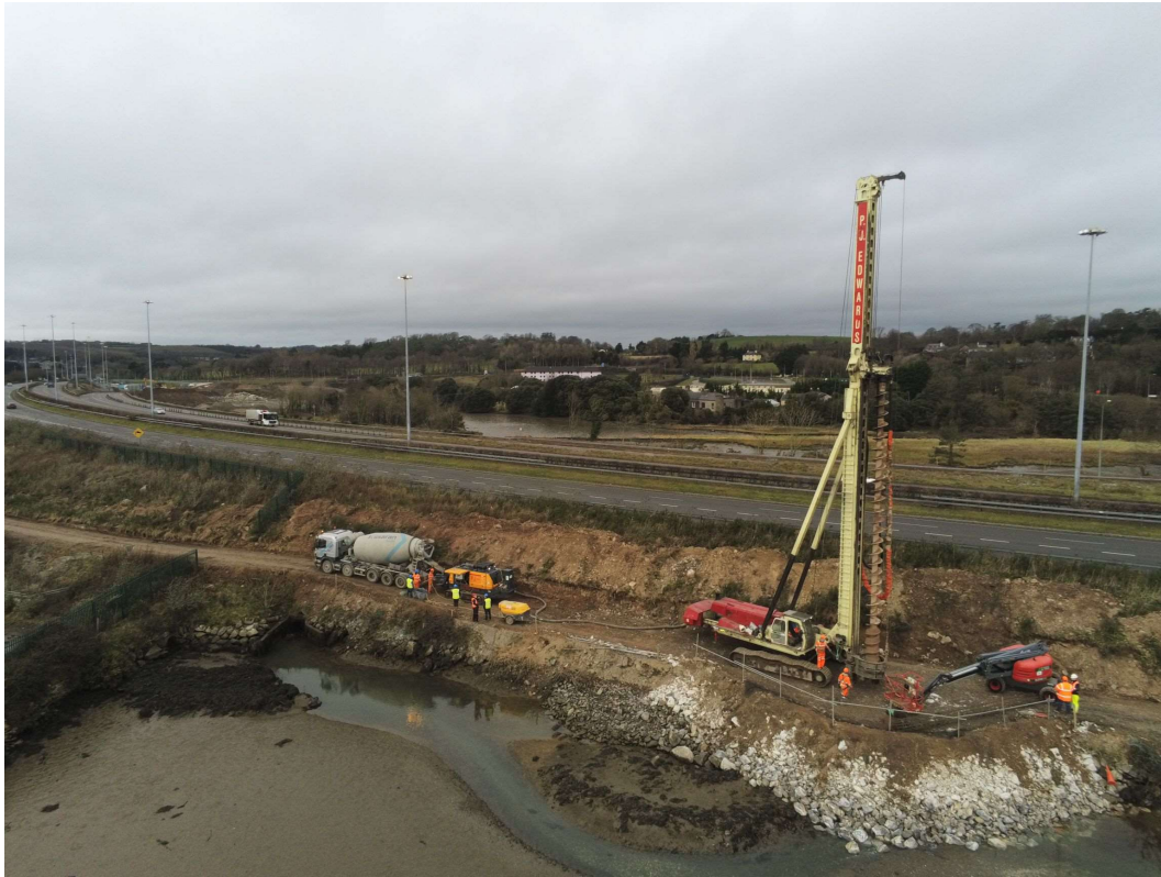
Preliminary piling works underway at proposed Structure 02 location