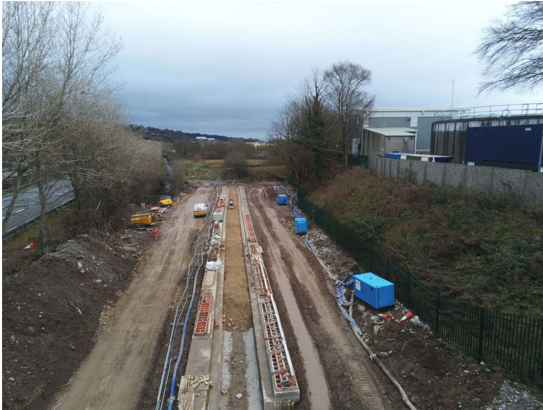
Preparatory works nearing completion for placing of the final protection slabs over the gas transmission main