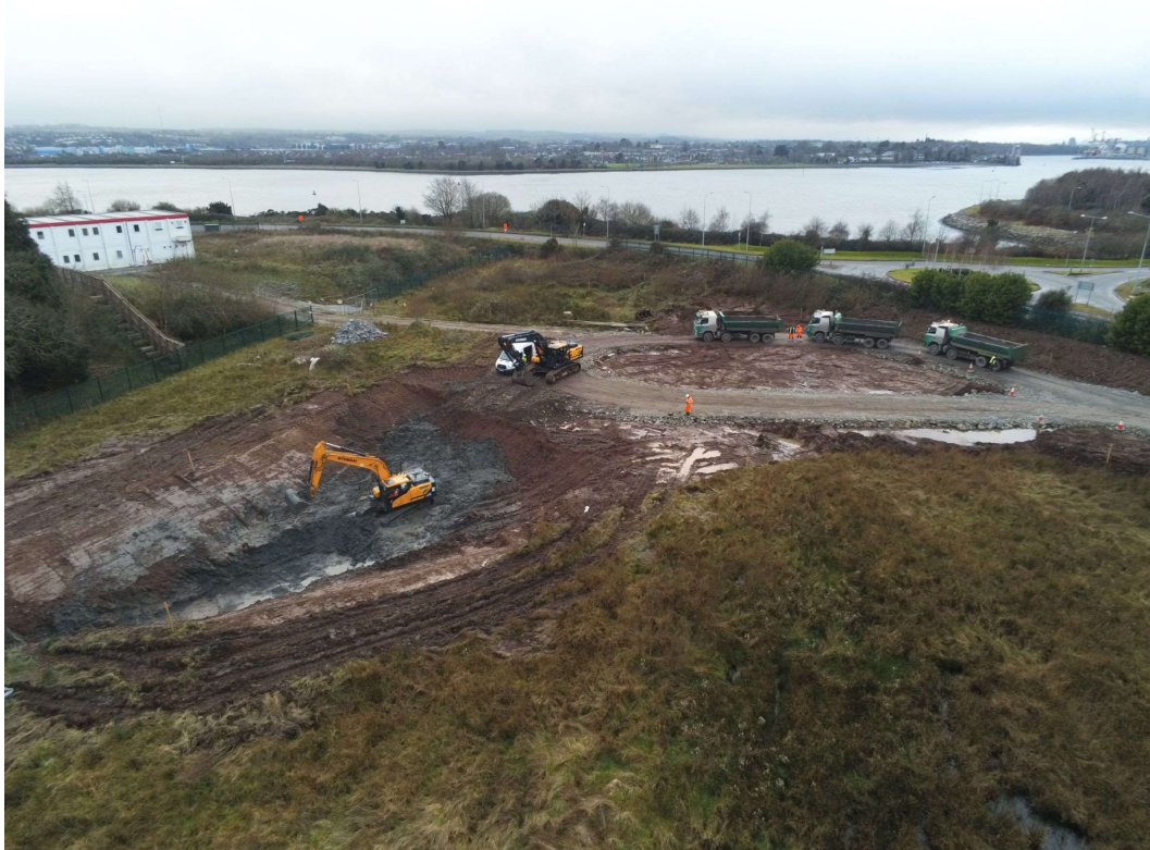
Excavation of new intertidal pond underway in the area east of the Jack Lynch Tunnel. The Dunkettle site office is visible in the background