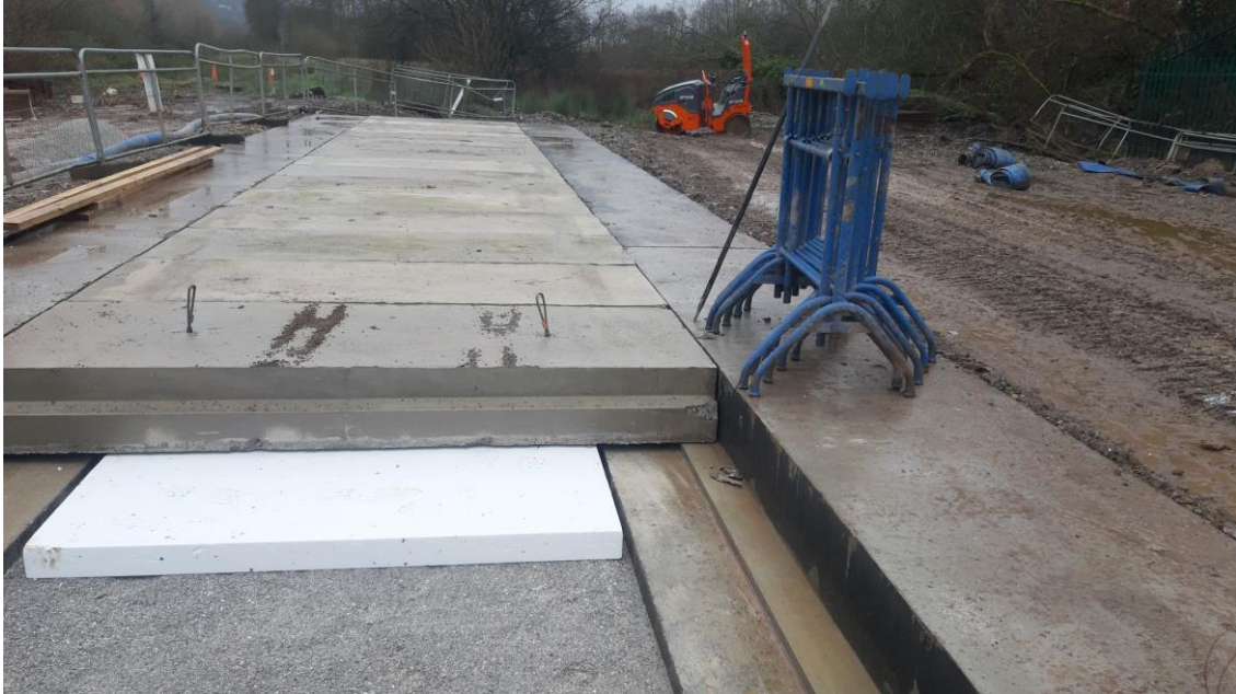
Protective slab installation works ongoing at the gas transmission main site