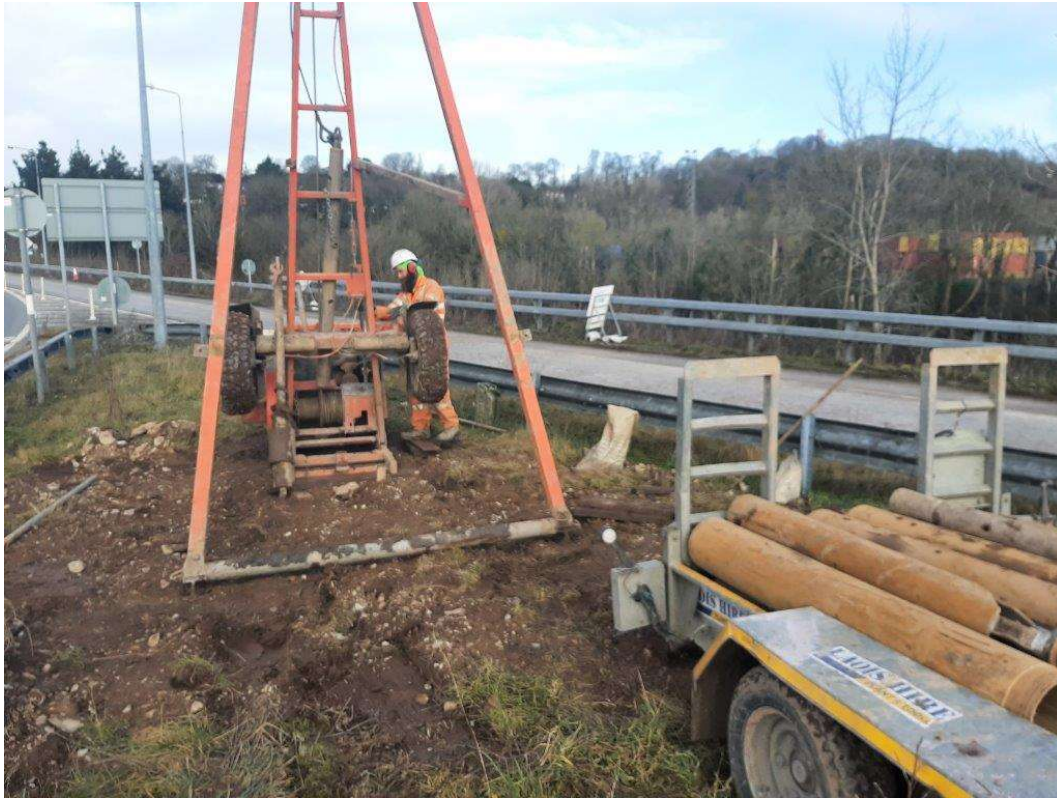
Borehole being installed in order to determine ground conditions at depth for the Dunkettle Interchange Upgrade Scheme