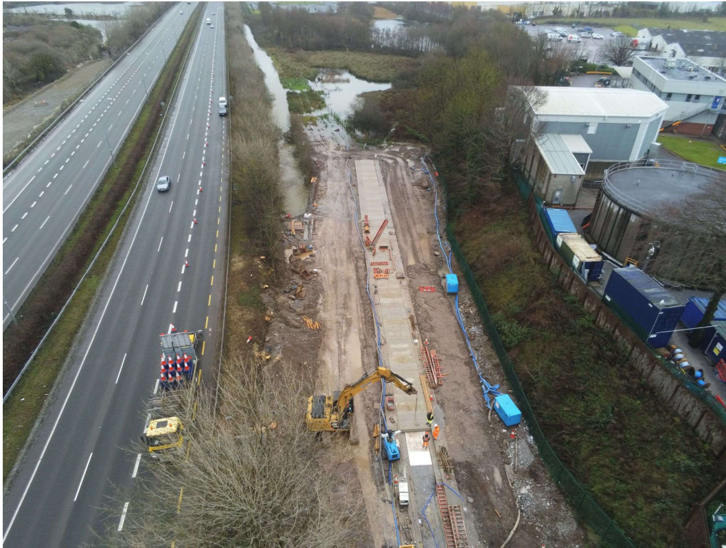
Installation of precast concrete protective slabs for gas transmission main nearing completion