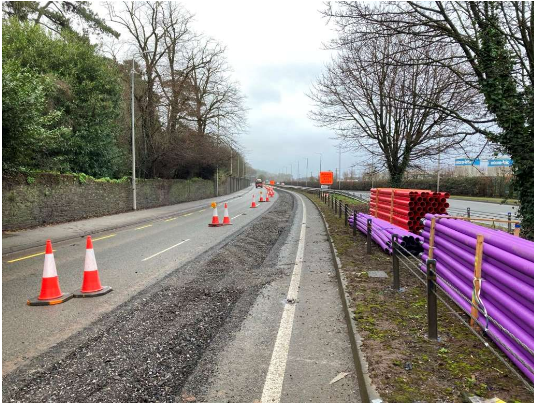
Duct installation works on the N8 at Tivoli