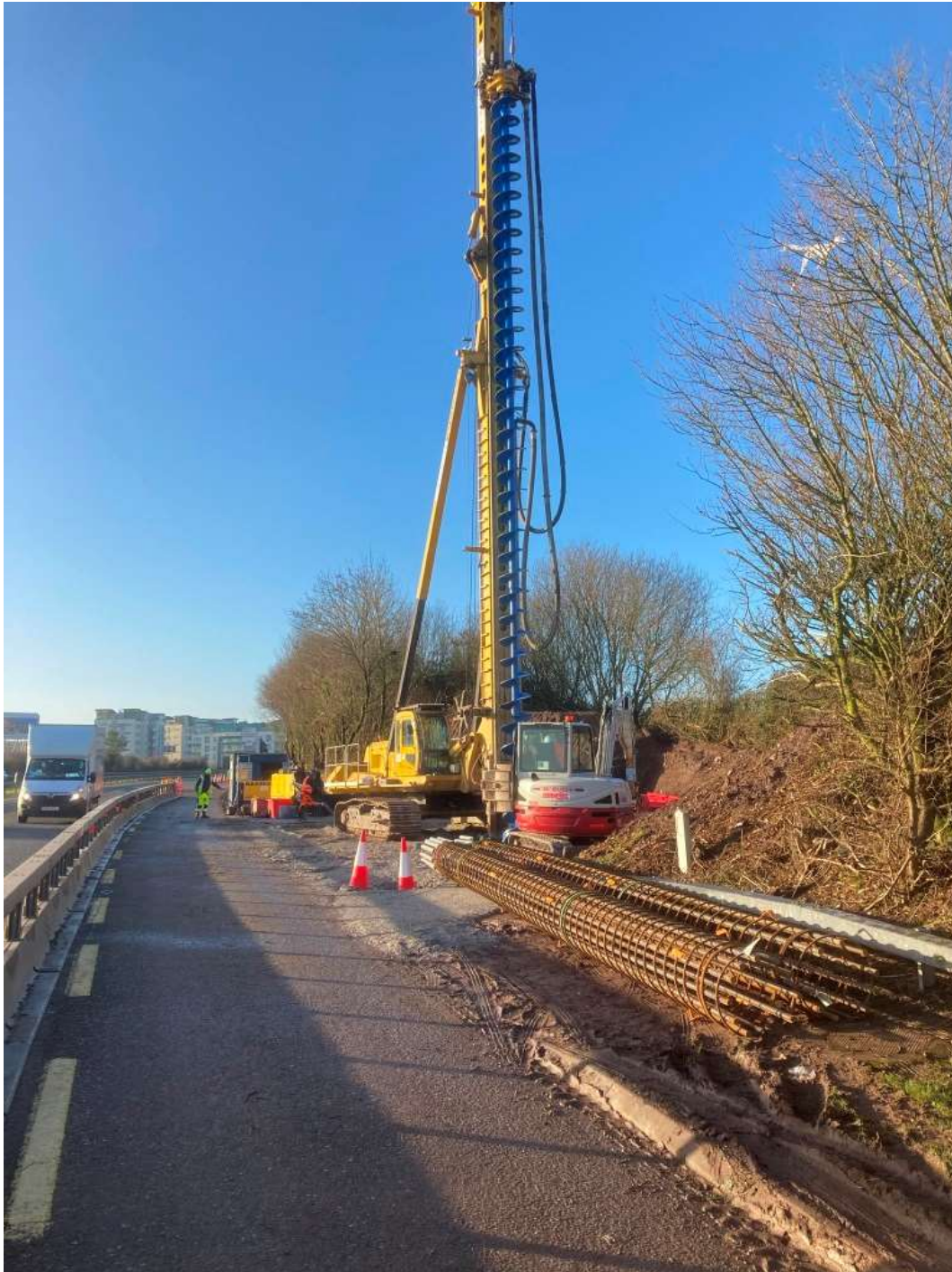
Reinforced concrete piles installed for gantry foundation