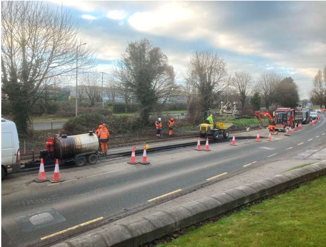
Trench reinstatement works ongoing at the M8 Eastbound