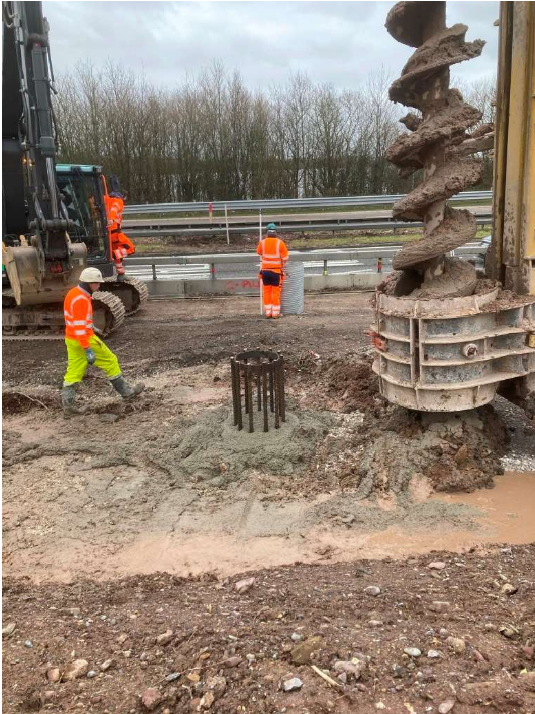
Reinforced pile just cast at the ITS site closest to the Tunnel