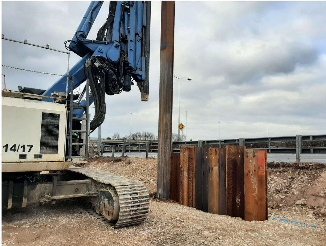
Temporary sheet piles being installed in order to protect the M8 Southbound lanes while the new bridge is constructed