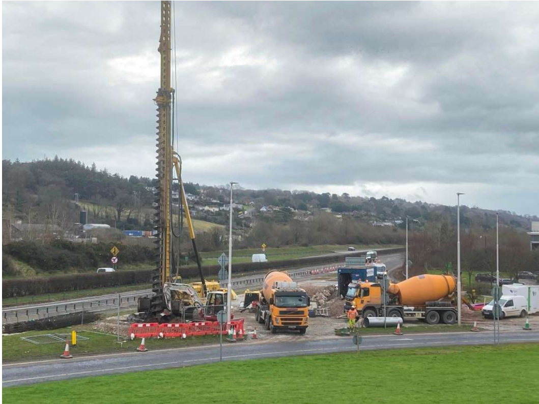
Reinforced concrete piles being installed on the N25 Westbound at the Little Island off/on ramps