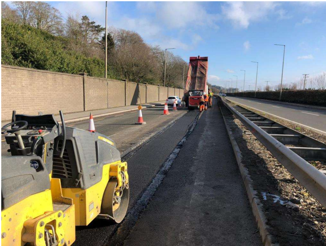
Completion of surfacing works ongoing on the N8 eastbound at Tivoli