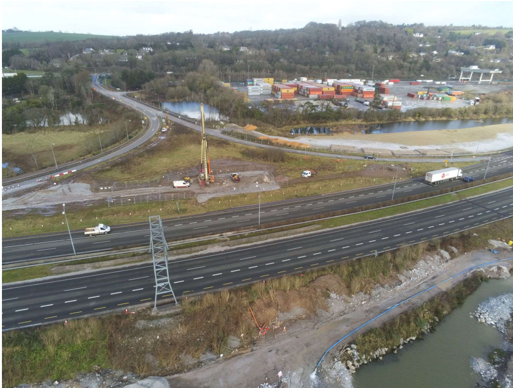
Piling works ongoing on what will be the northern abutment for the new N25 overbridge