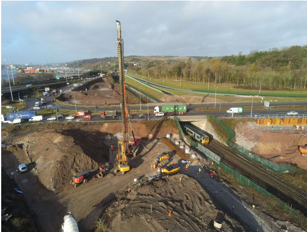
Piling works ongoing on the southern side of the railway line with the Midleton to Cork train passing nearby