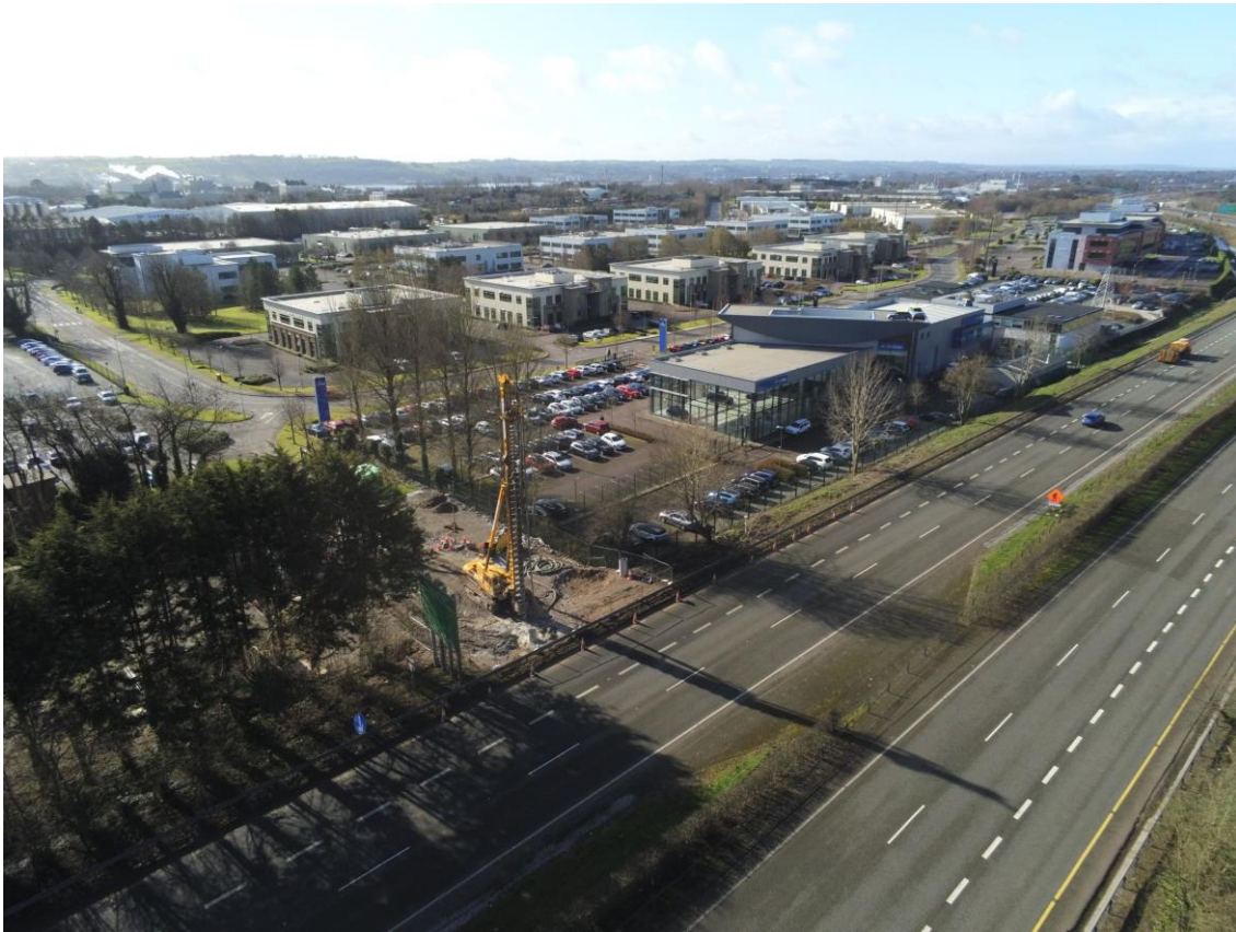
Piling works ongoing in the verge of the N25 westbound in the Little Island Interchange area