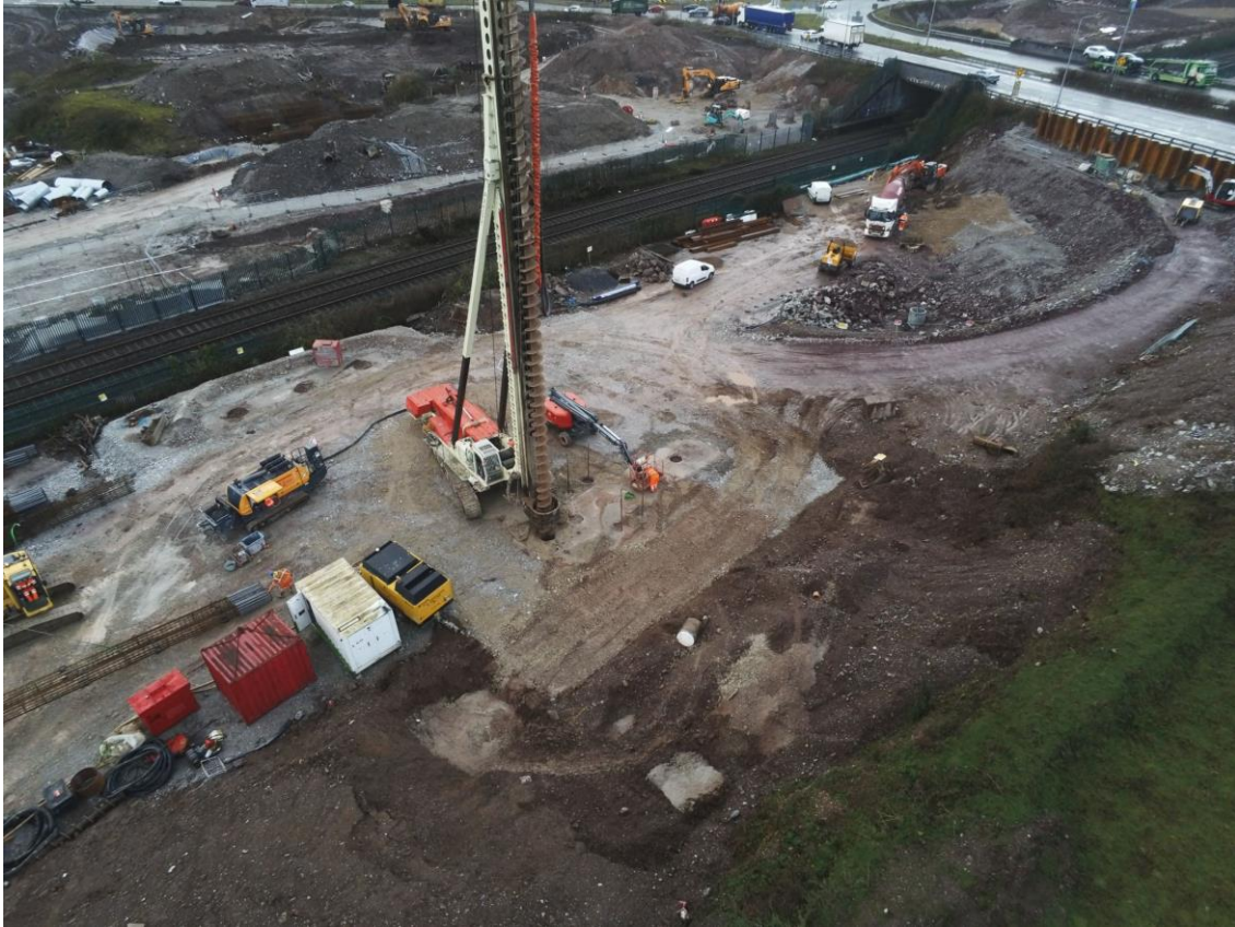
Piling works ongoing at ST09, north of the railway line