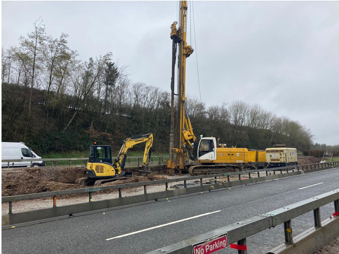
Piling works underway at the M8 median area on approach to Dunkettle