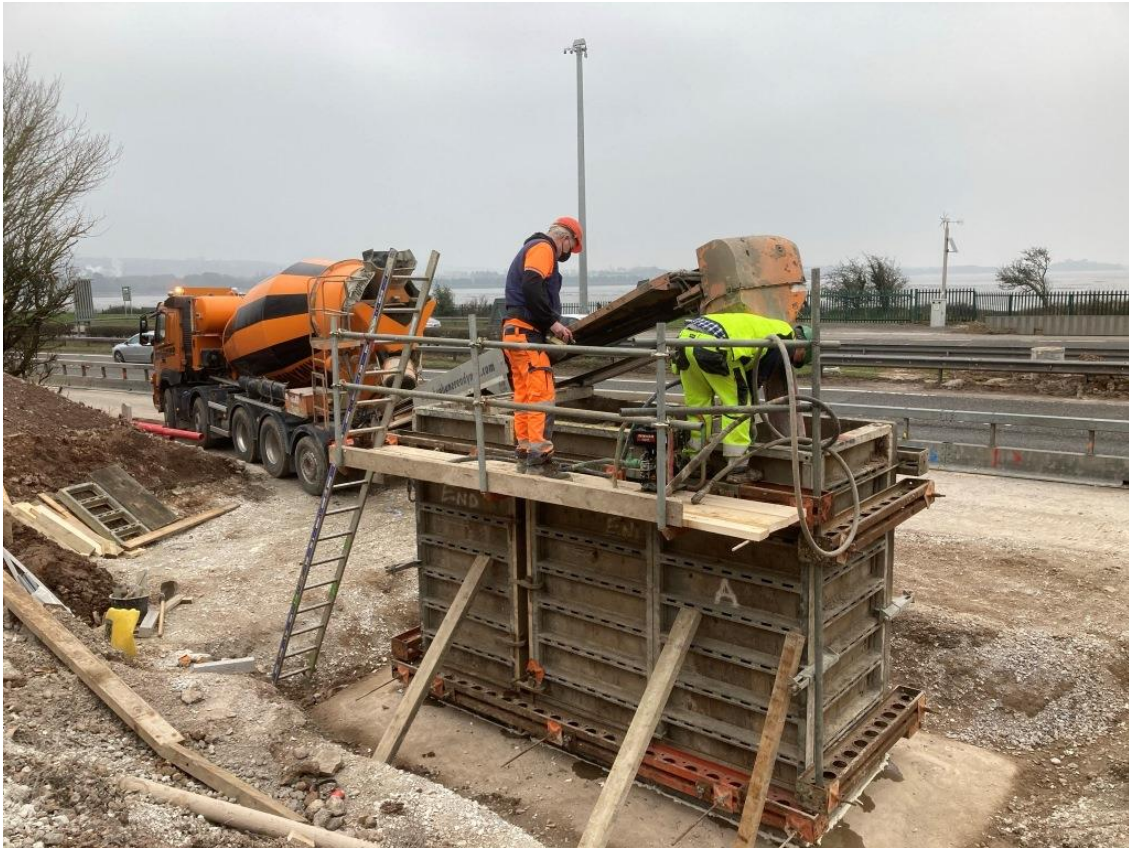
Concrete pour ongoing for gantry foundation at the site adjoining the N40 eastbound