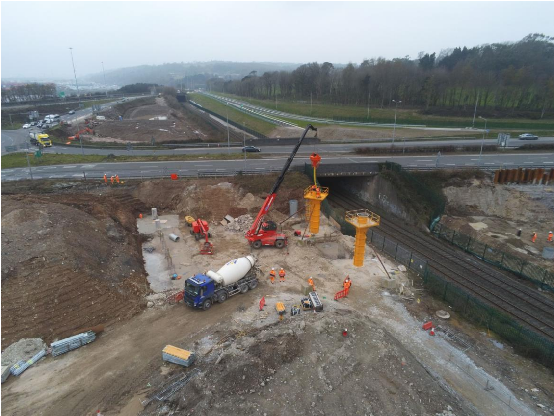
Column construction underway south of the Cork-Midleton railway line for Structure ST08