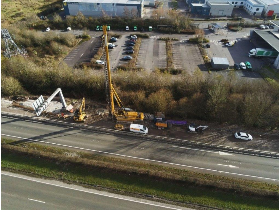
Piling works ongoing for new ITS equipment adjacent to the N25 westbound