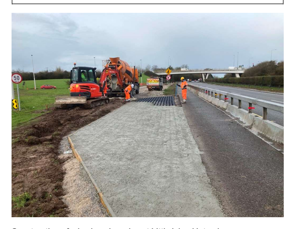
Construction of a lay-by advancing at Little Island Interchange

Works will also continue on the N25, adjoining the westbound lanes as shown in the photographs below.