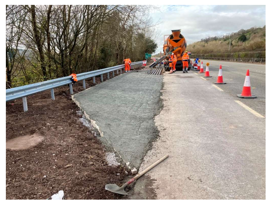
Concreting works ongoing in the lay-by area in the new ITS site west of Little Island Interchange adjoining the N25 westbound lanes

Traffic on the M8 northbound will be reduced to one lane for a number of days during week commencing Monday 29th March 2021 in order to facilitate works in the M8 median. Again, no significant disruption to traffic is anticipated as a result of these works.