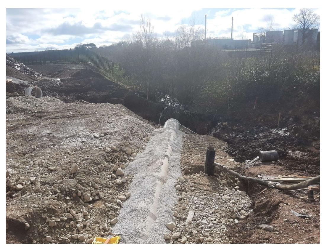
Culvert installation works nearing completion as part of overall road drainage arrangements on proposed Link Q