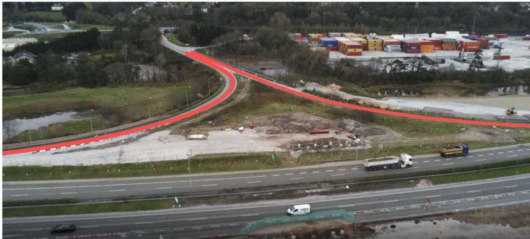
Area to be closed from Monday 29th March 2021 shown coloured red