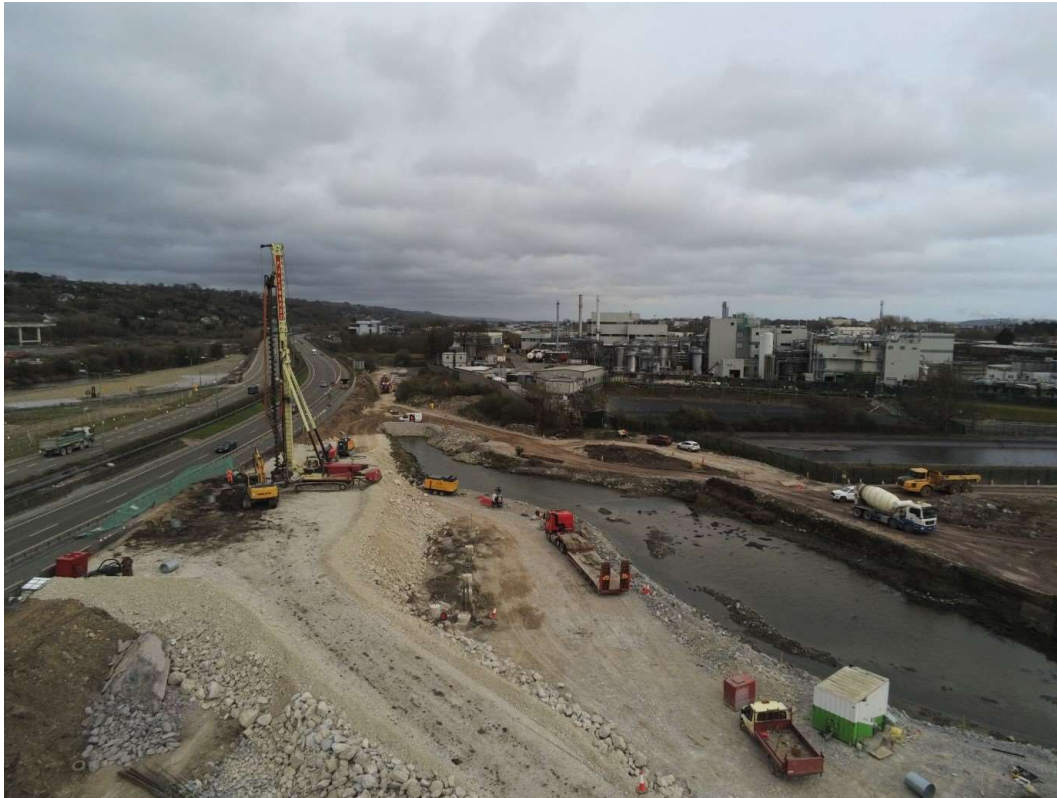
Piling works ongoing from what will become the southern abutment of ST01 in the area immediately south of the N25