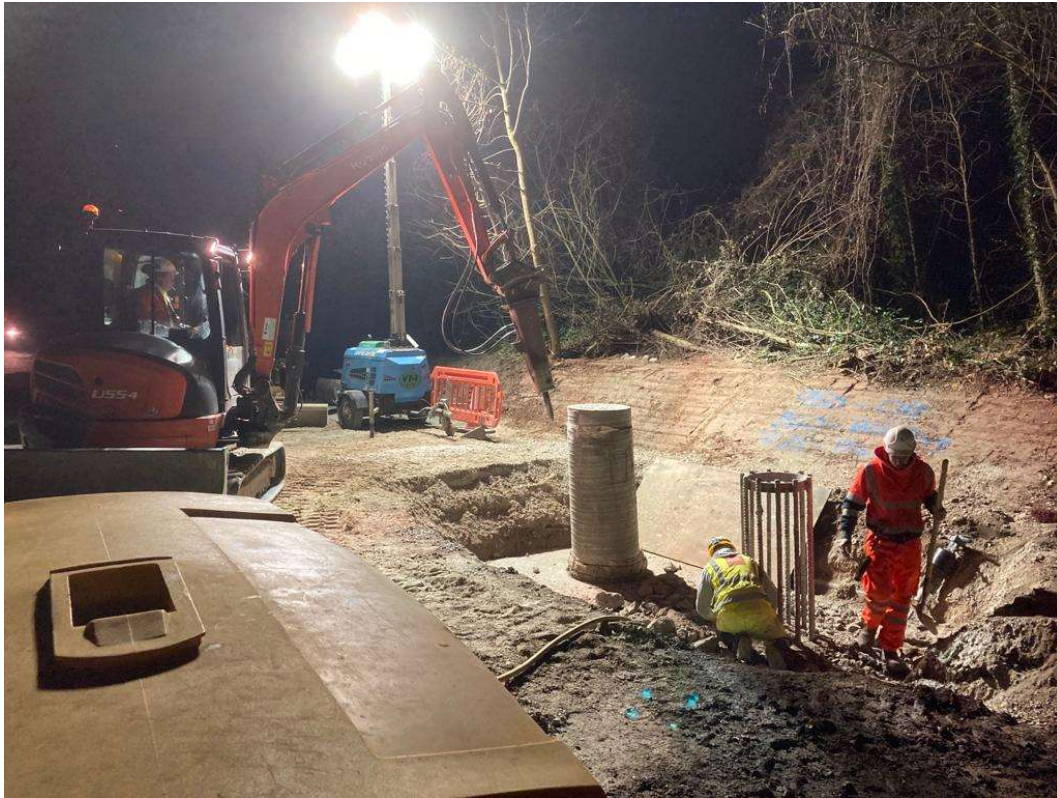
Piled cap construction works underway near Bloomfield Interchange to facilitate the erection of a new gantry sign at this location