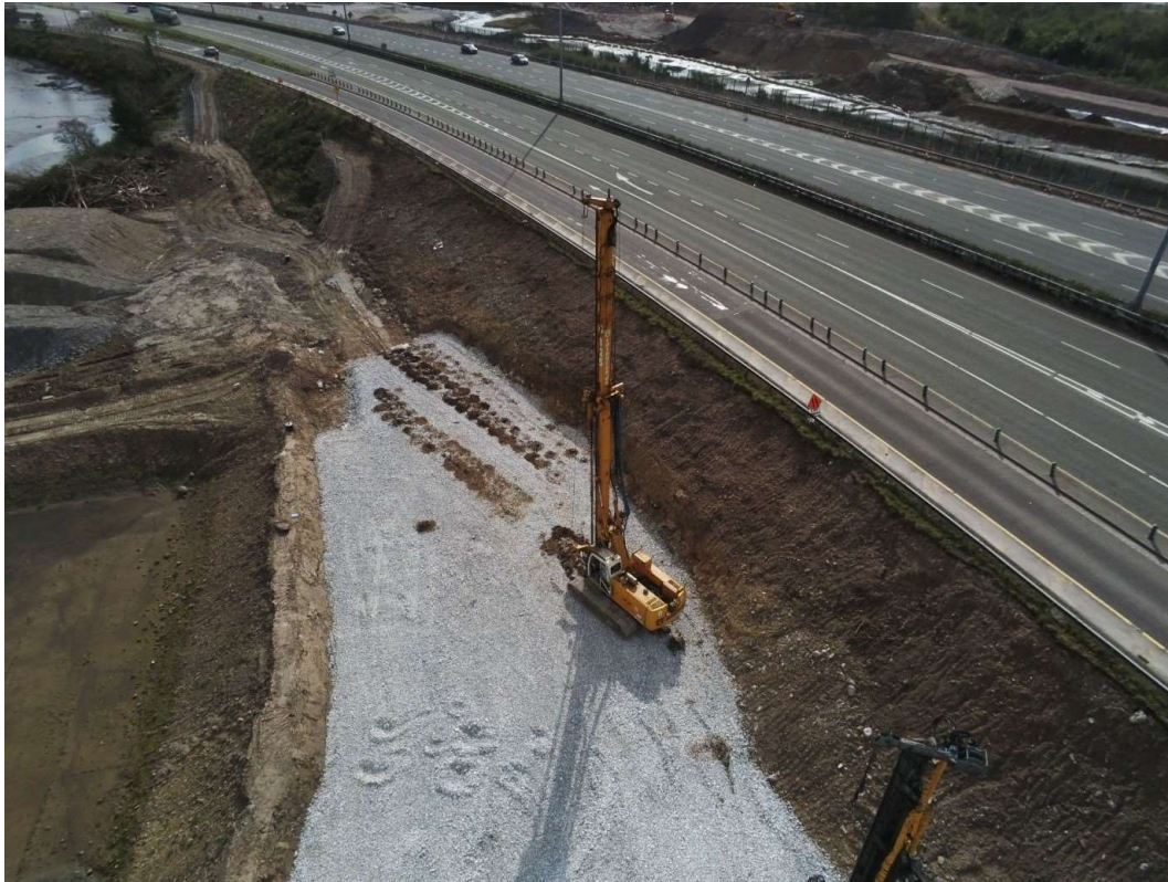
Preliminary ground improvement works underway at proposed Link E immediately adjacent to the N25 eastbound lanes