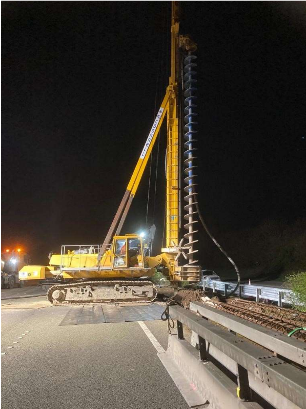
Pile construction works underway in the N25 median area under night time lane closures