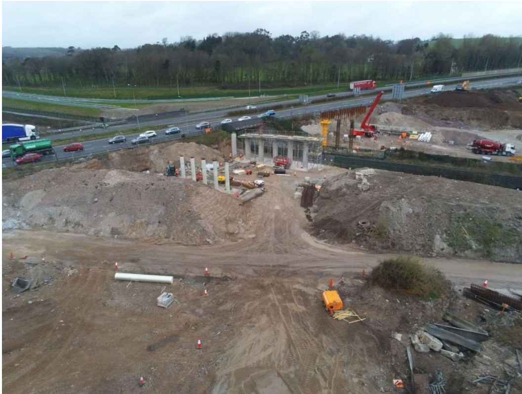
Column construction underway in the ST08/ST09 area with the M8 southbound lanes in the background