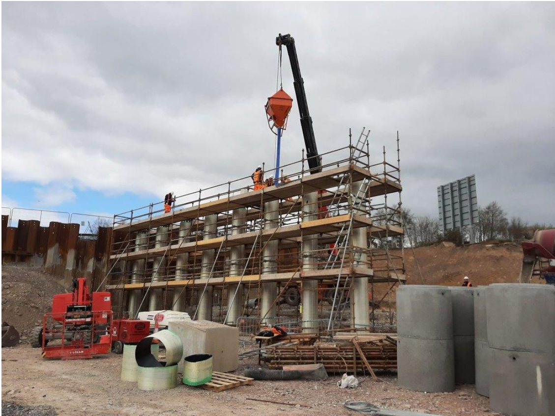
Installation of reinforced earth panels and straps for ST09 north.