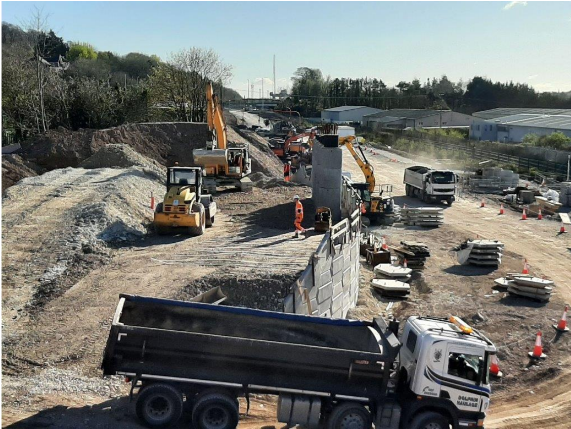
Installation of reinforced earth panels and straps for ST09 north.