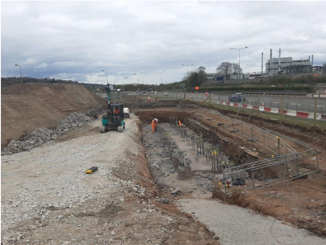
Breaking down of piles at ST01 north of the N25.