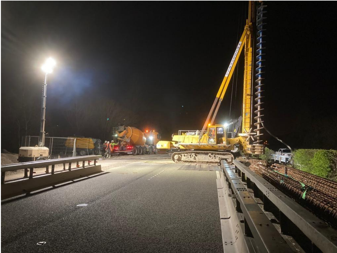
Bored Piles being installed in the central median of the N25 under a night time closure.